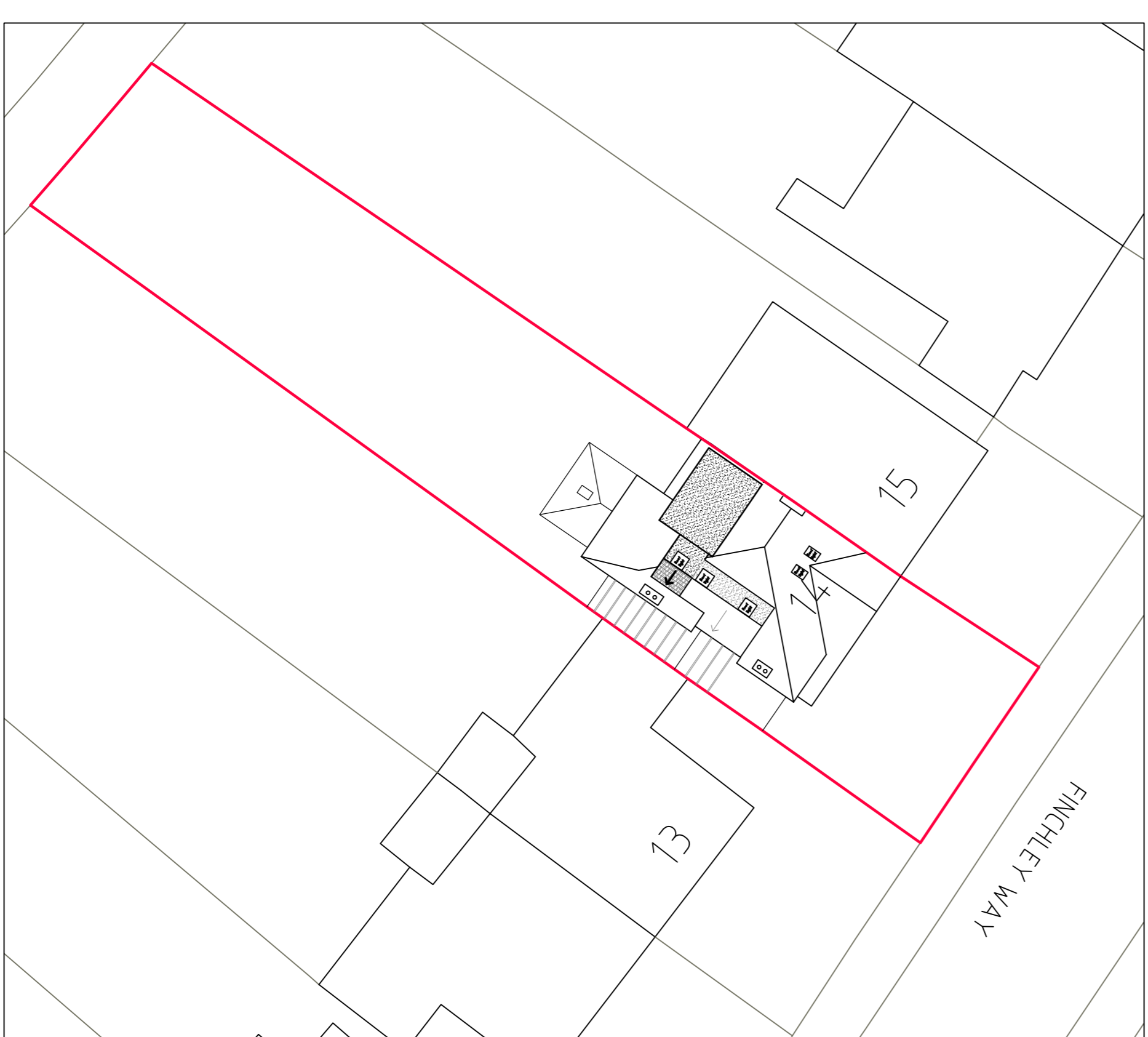
BLOCK PLAN SCALE 1:200@A1 N