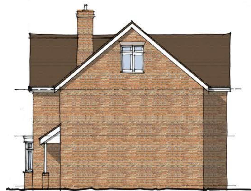
Proposed Side Elevation Scale 1:100