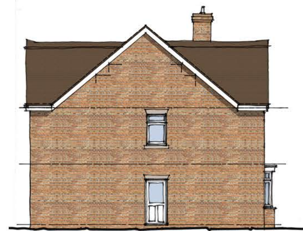
Proposed Side Elevation Scale 1:100