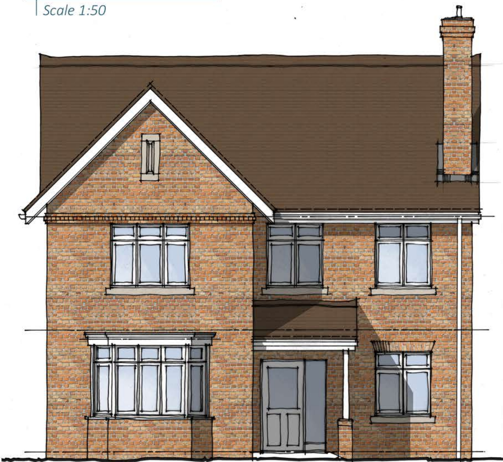
Proposed Front Elevation Scale 1:50