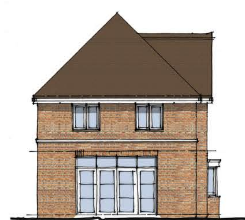
Proposed Rear Elevation Scale 1:100