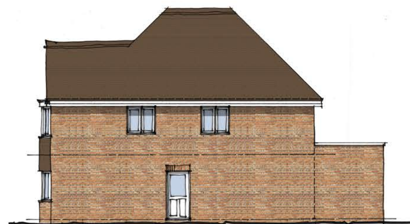
Proposed Side Elevation Scale 1:100