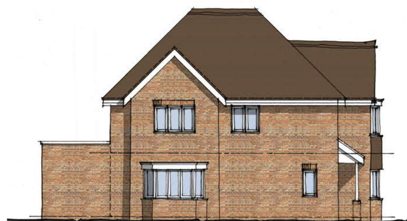
Proposed Side Elevation Scale 1:100