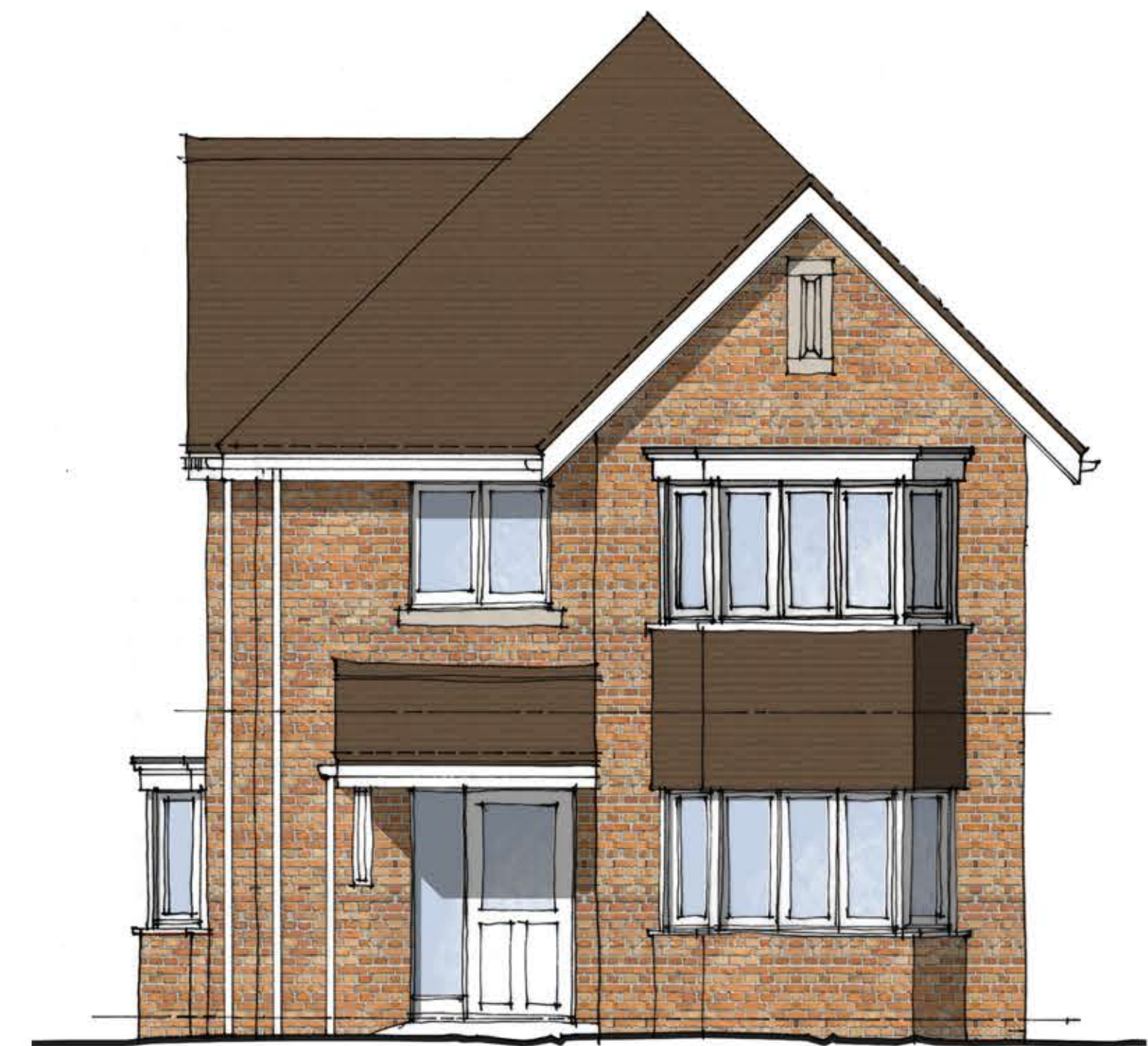
Proposed Front Elevation Scale 1:50