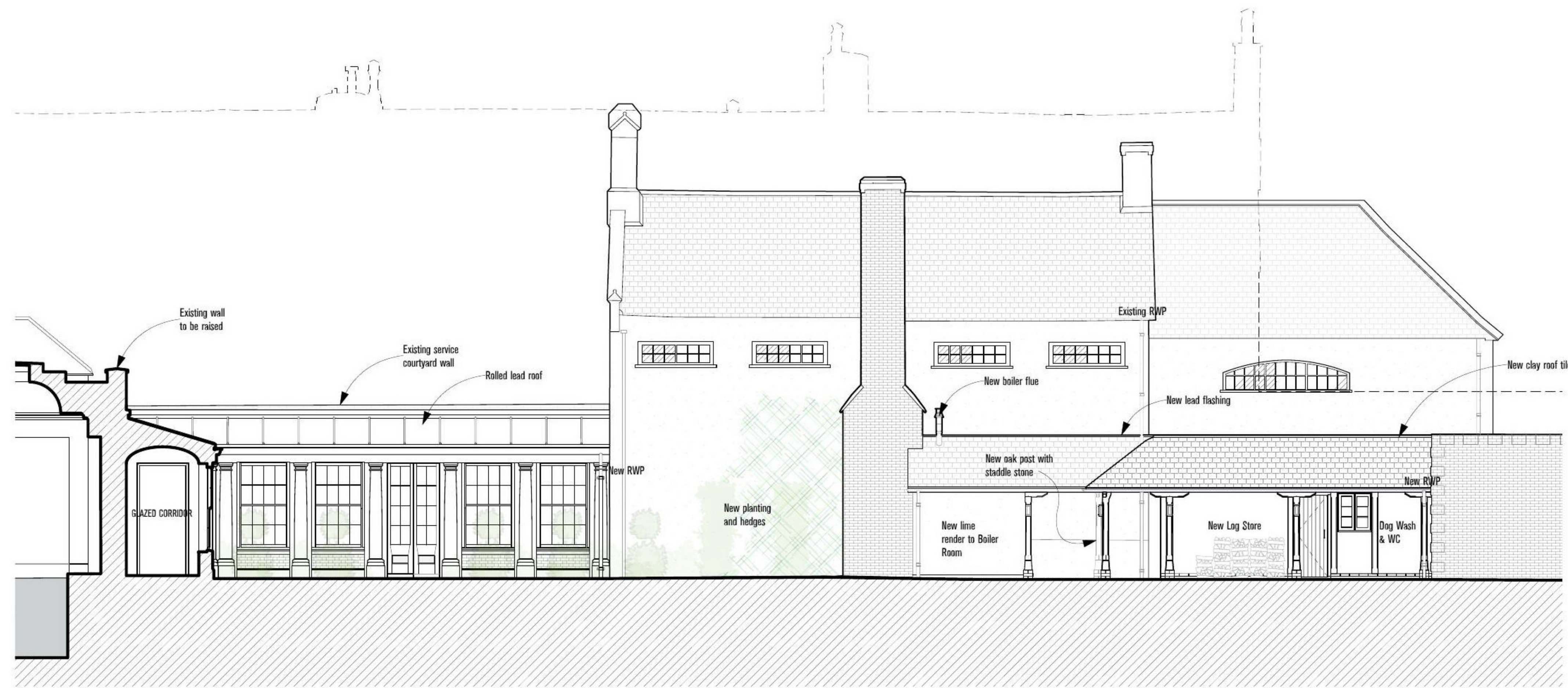
WEST ELEVATION (Wyddial Parva)