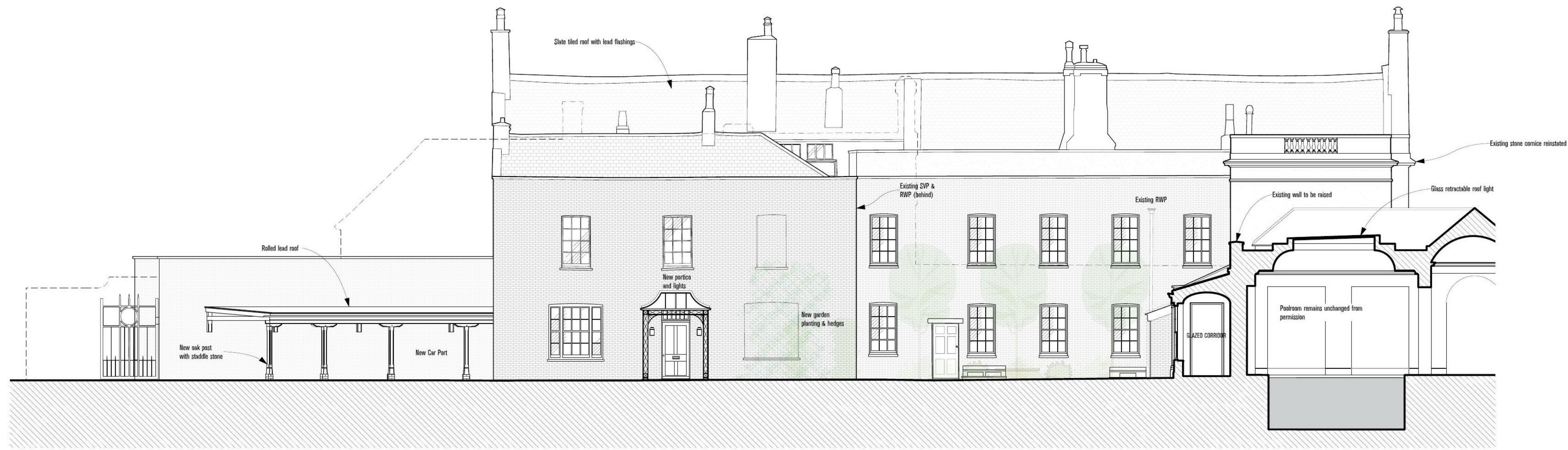
EAST ELEVATION (Wyddial Hall)

DRAWING DATE: 01/02/21 Sawking Harper Architects Ltd copyright 2021 This drawing must not be reproduced in part or whole without prior written consent. Scale to be checked against scale bar as this drawing has been provided electronically. Check and confirm all dimensions on site prior to commencing work. IF IN DOUBT ASK.