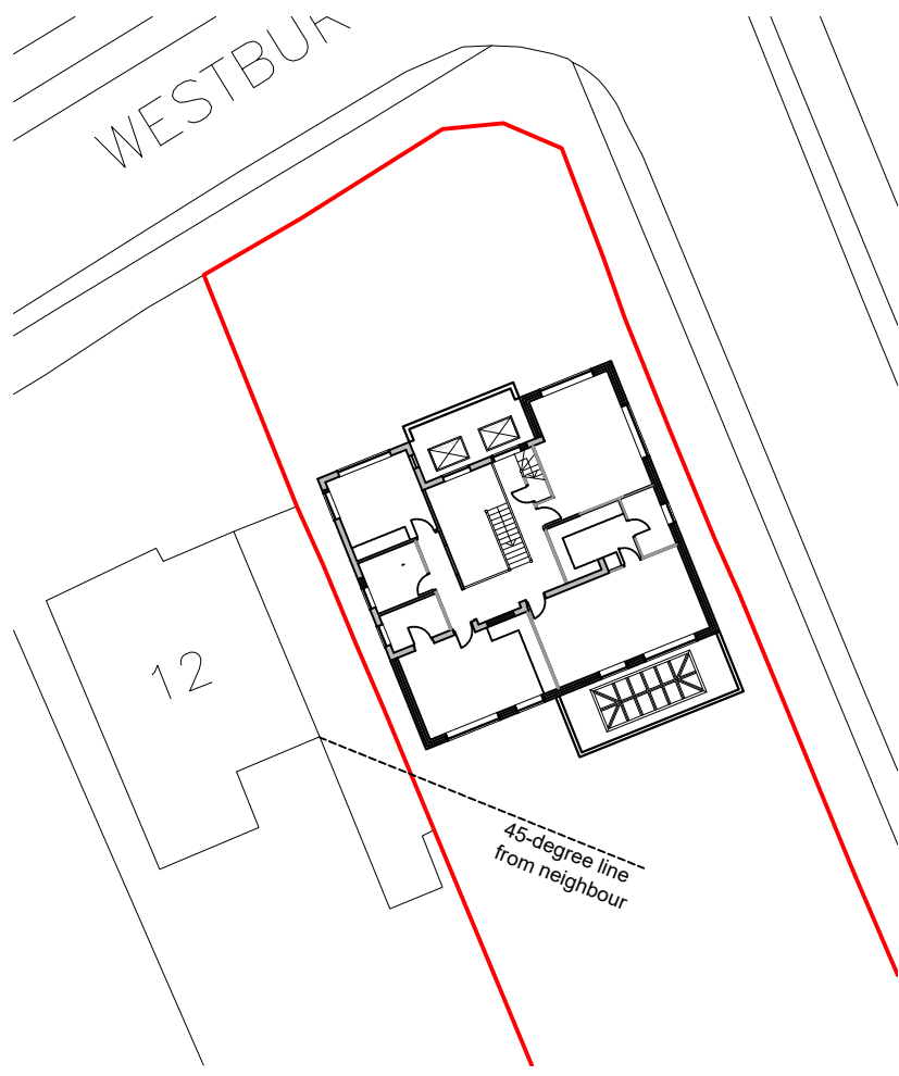
Proposed First Floor Plan On Site