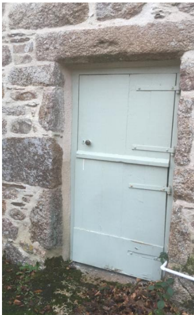
(Dia.3) Existing Stable door

Diagram 2 shows an internal image of the outbuilding showing the current concrete block. It is proposed this is removed to allow a new doorway to be constructed.