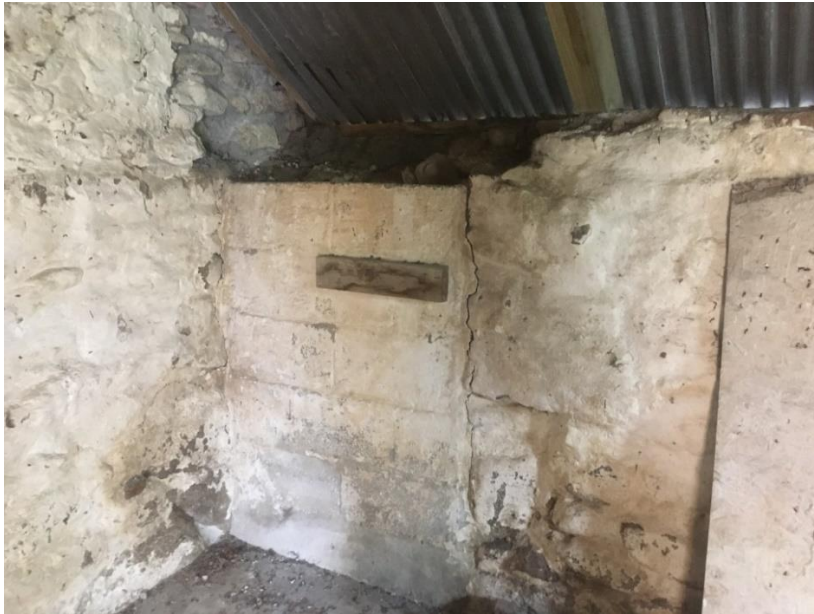
(Dia. 2) Internal image

Diagram 2 shows an internal image of the outbuilding showing the current concrete block. It is proposed this is removed to allow a new doorway to be constructed.