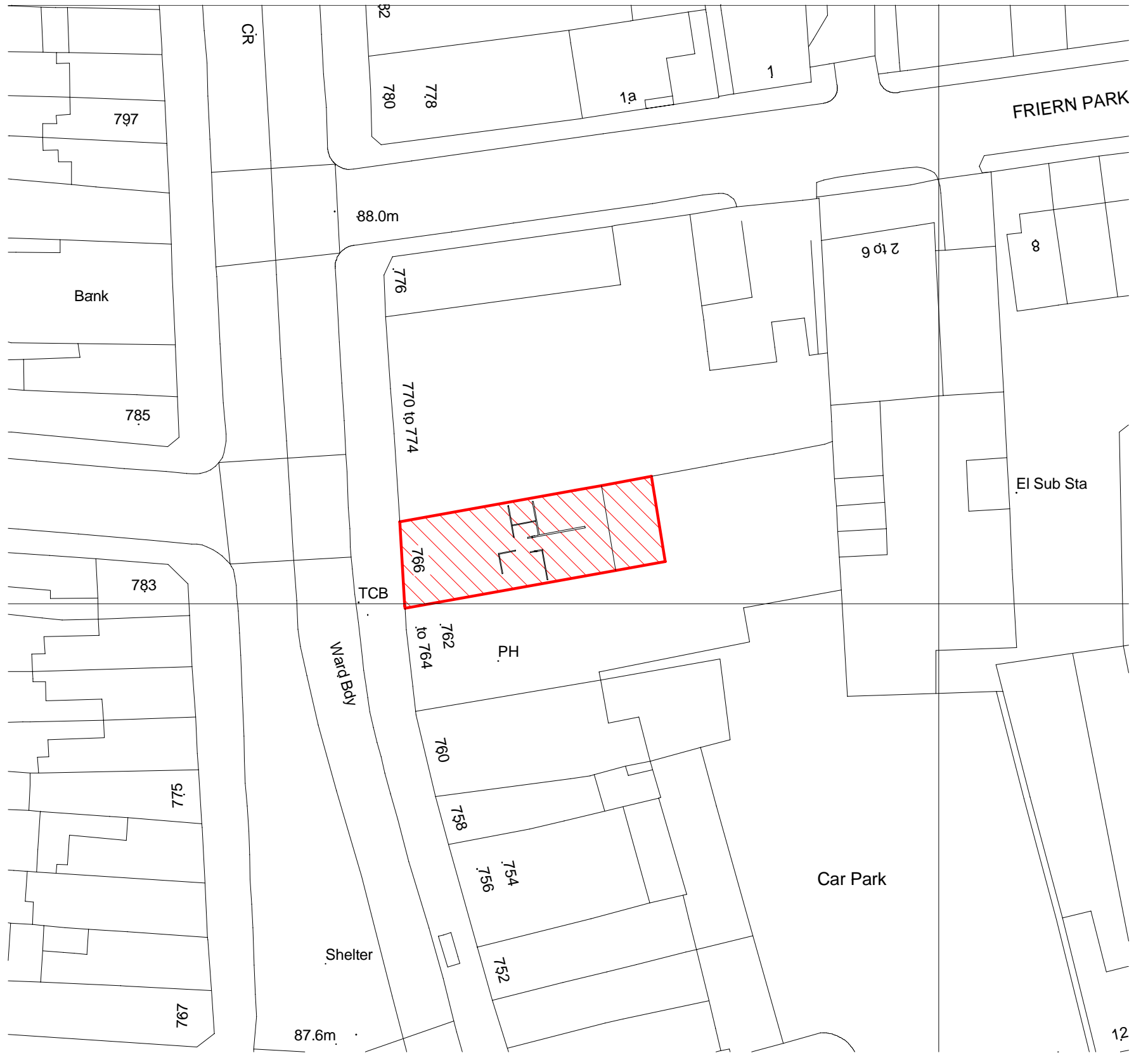
2 Site Plan 1 : 500