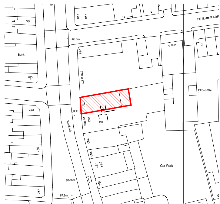
1 Location Plan 1 : 1250