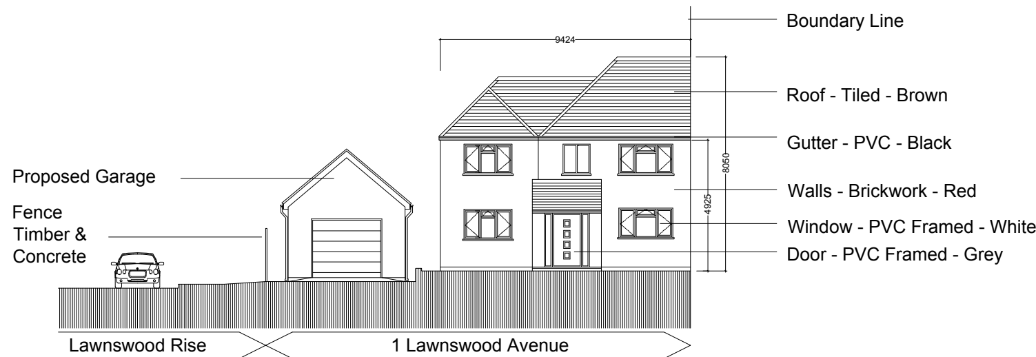
PROPOSED SITE ELEVATION - NORTH