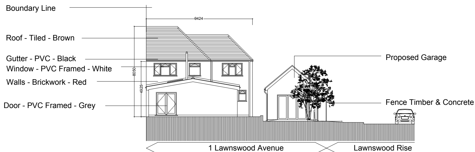
PROPOSED SITE ELEVATION - SOUTH