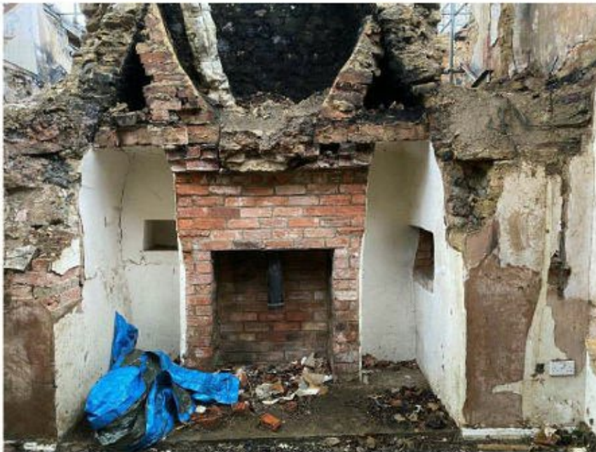
9. Ground floor internal view towards bread oven fire