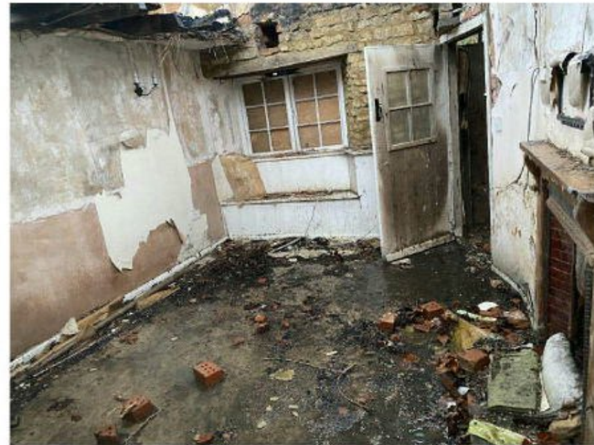
10. Ground floor internal view of sitting room