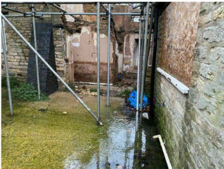
5. Rear view of wall demolished for access