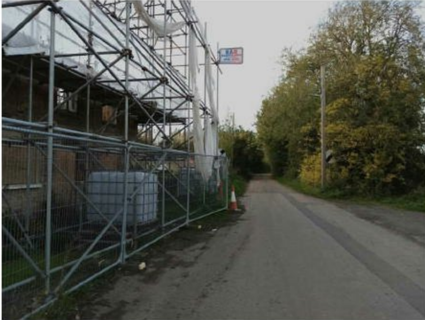
1. Frontage looking North out of village