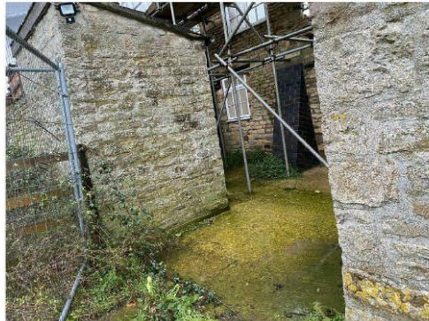
4. Rear view towards outbuildings courtyard