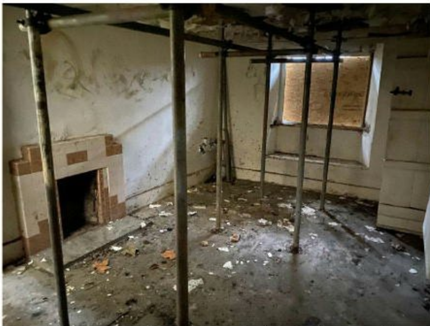
11. Ground floor internal view of lounge 1