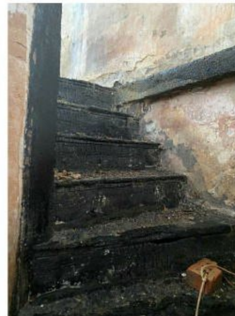
12. Ground floor internal view of stair 2