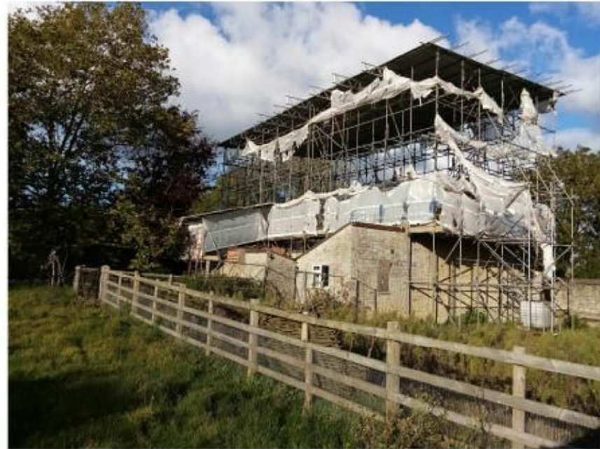
2. Rear view looking North