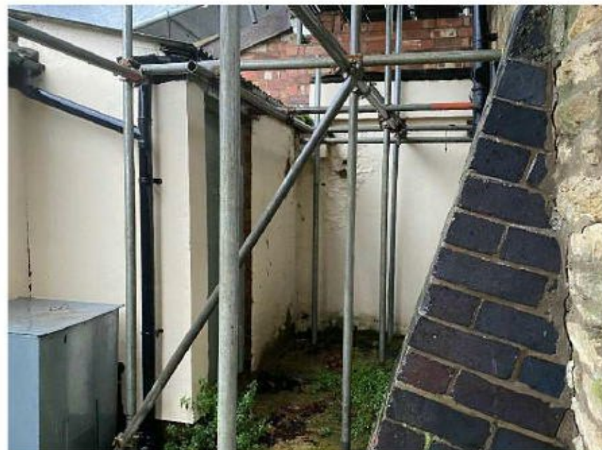
6. Courtyard view of outbuildings & kitchen 1