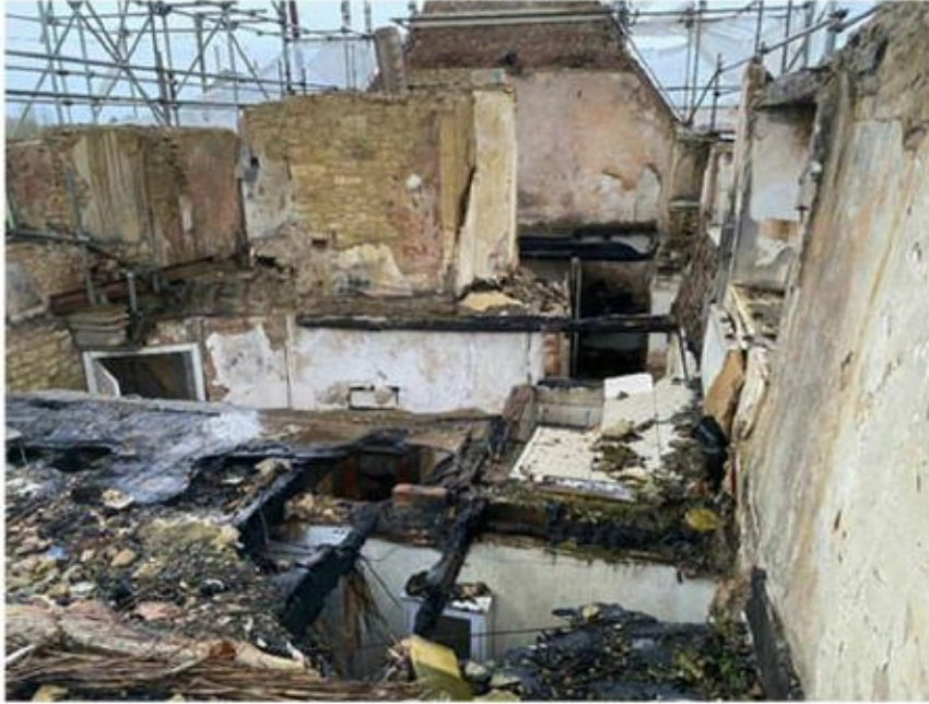
7. First floor internal view looking South from stair 1