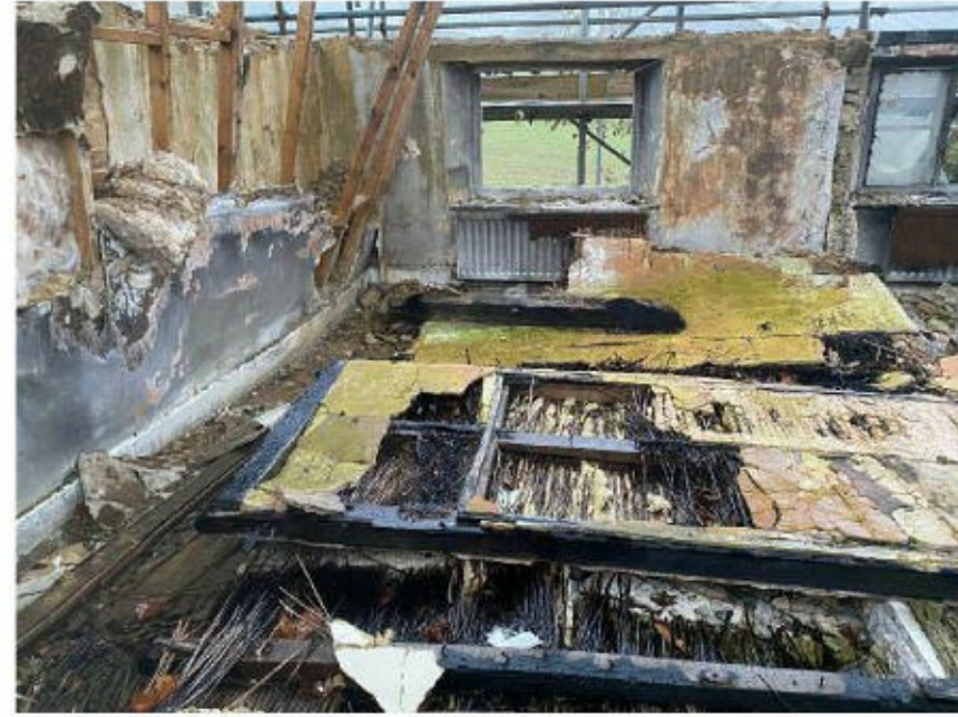
8. First floor internal view looking East from stair 1