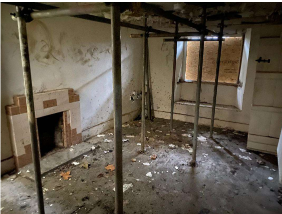
11. Ground floor internal view of lounge 1