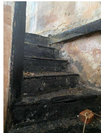
12. Ground floor internal view of stair 2