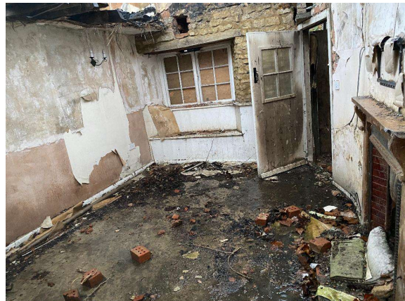
10. Ground floor internal view of sitting room