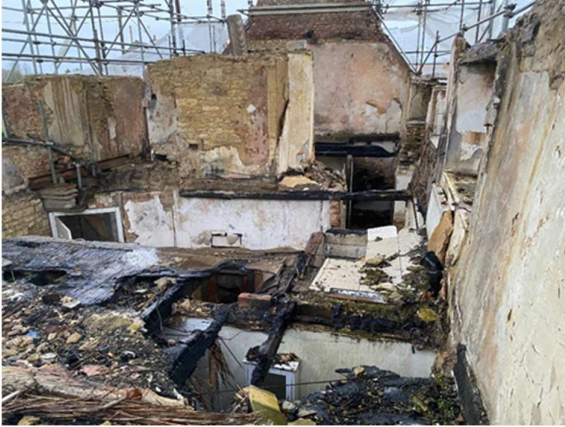
7. First floor internal view looking South from stair 1