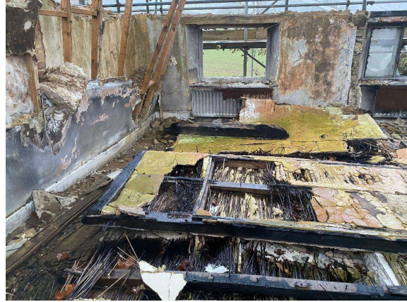
8. First floor internal view looking East from stair 1