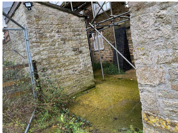
4. Rear view towards outbuildings courtyard