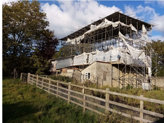
2. Rear view looking North