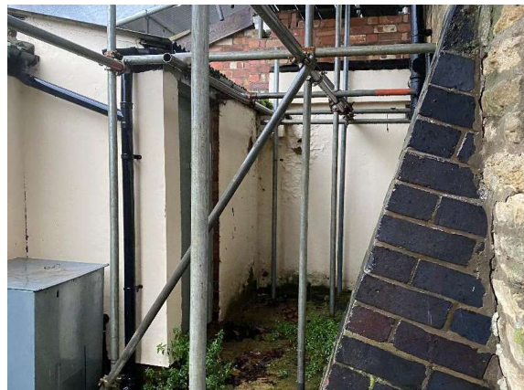
6. Courtyard view of outbuildings & kitchen 1