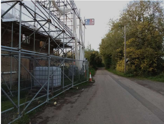
1. Frontage looking North out of village