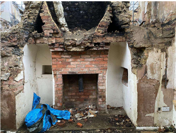
9. Ground floor internal view towards bread oven fire