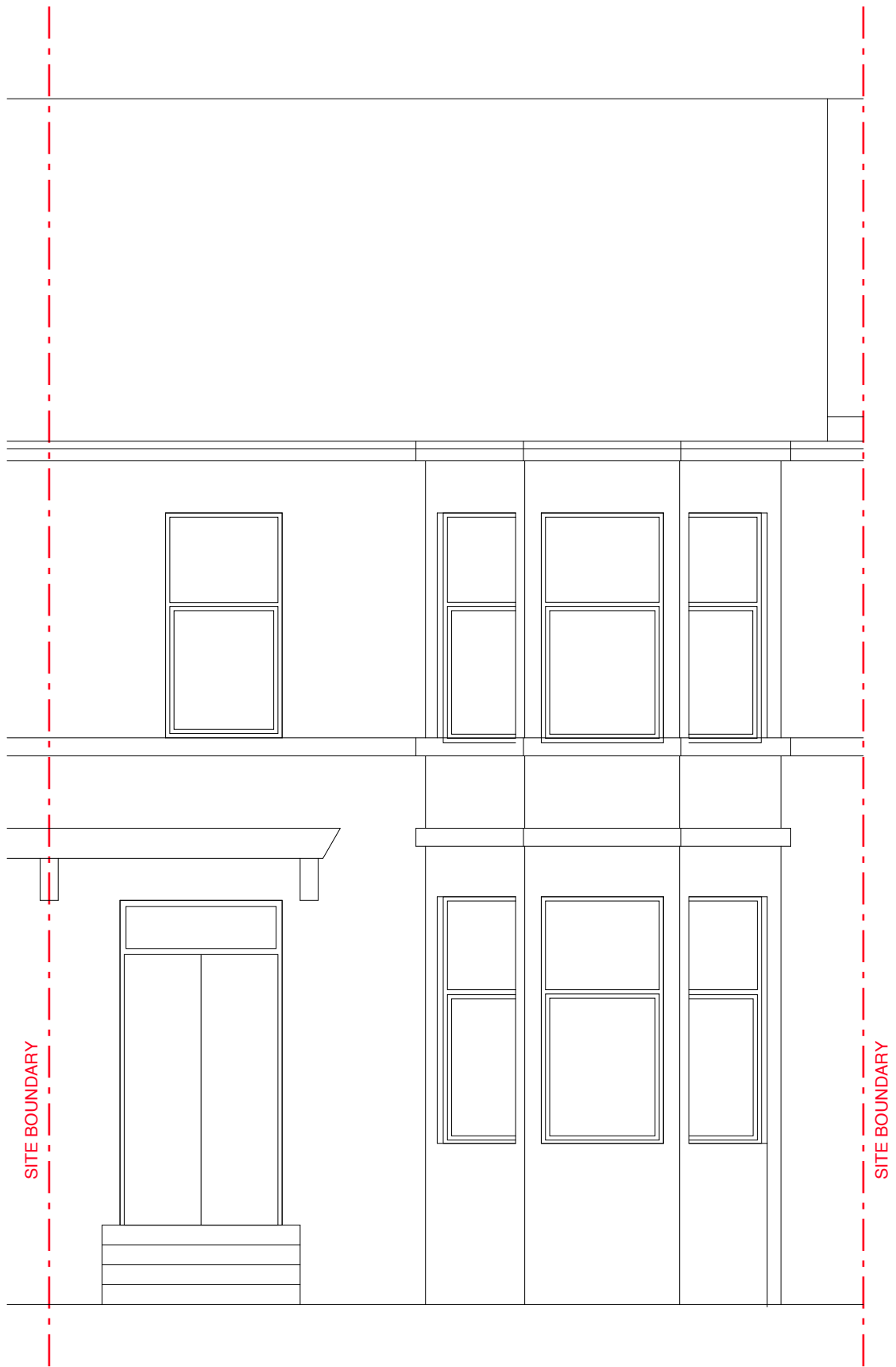
1 North East Elevation

Notes This drawing is the copyright © property of Hypostyle Designs Ltd - no copying or distribution of this drawing or any part thereof is permitted without prior written permission. Do not scale from this drawing. All existing dimensions to be checked on site prior to commencement of works or manufacturing of components. Any discrepancies to be brought to the attention of the architect - if in doubt, ask.