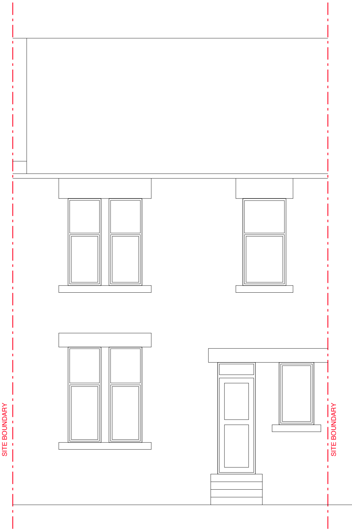
2 South West Elevation