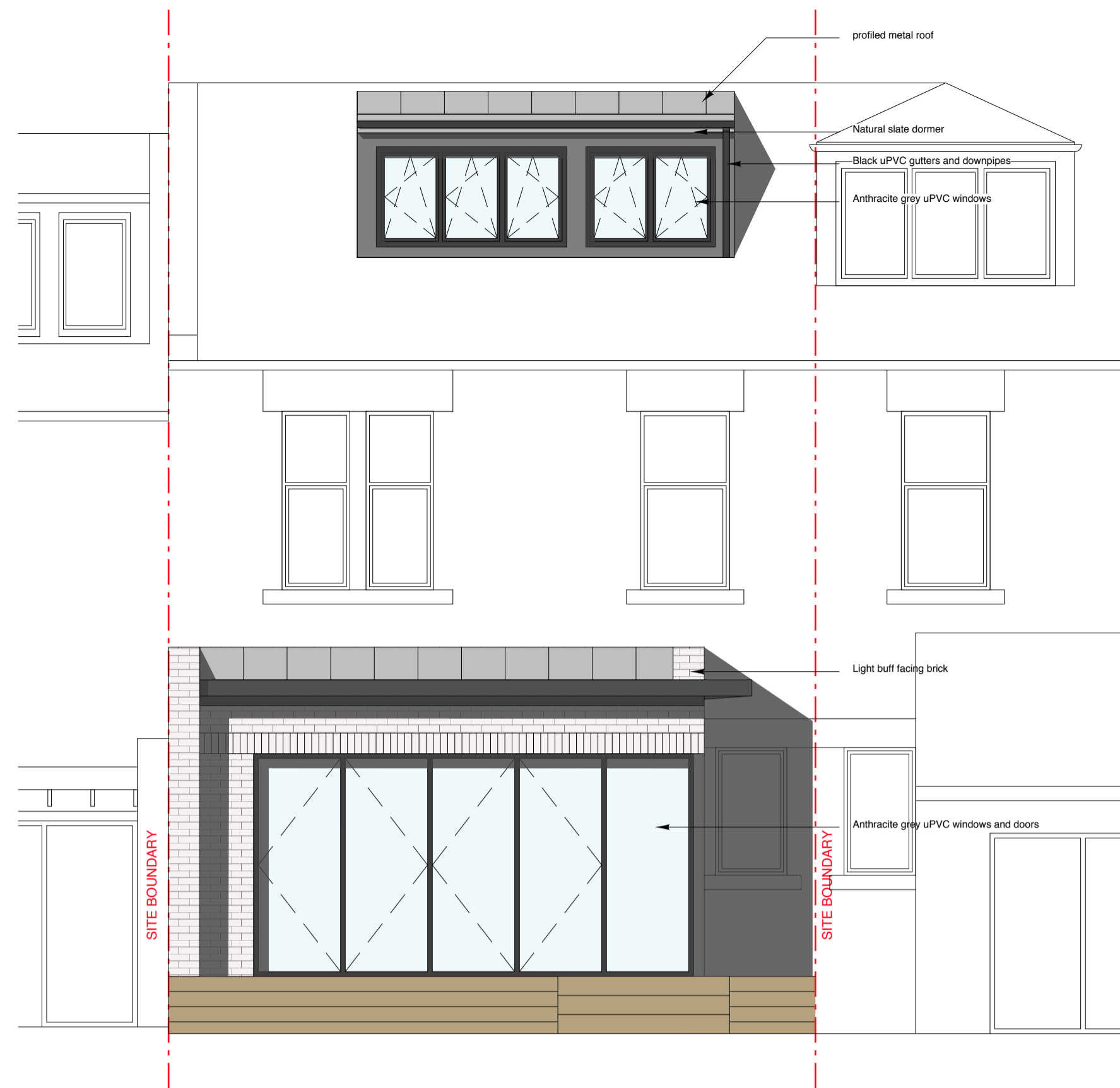
2 South West Elevation