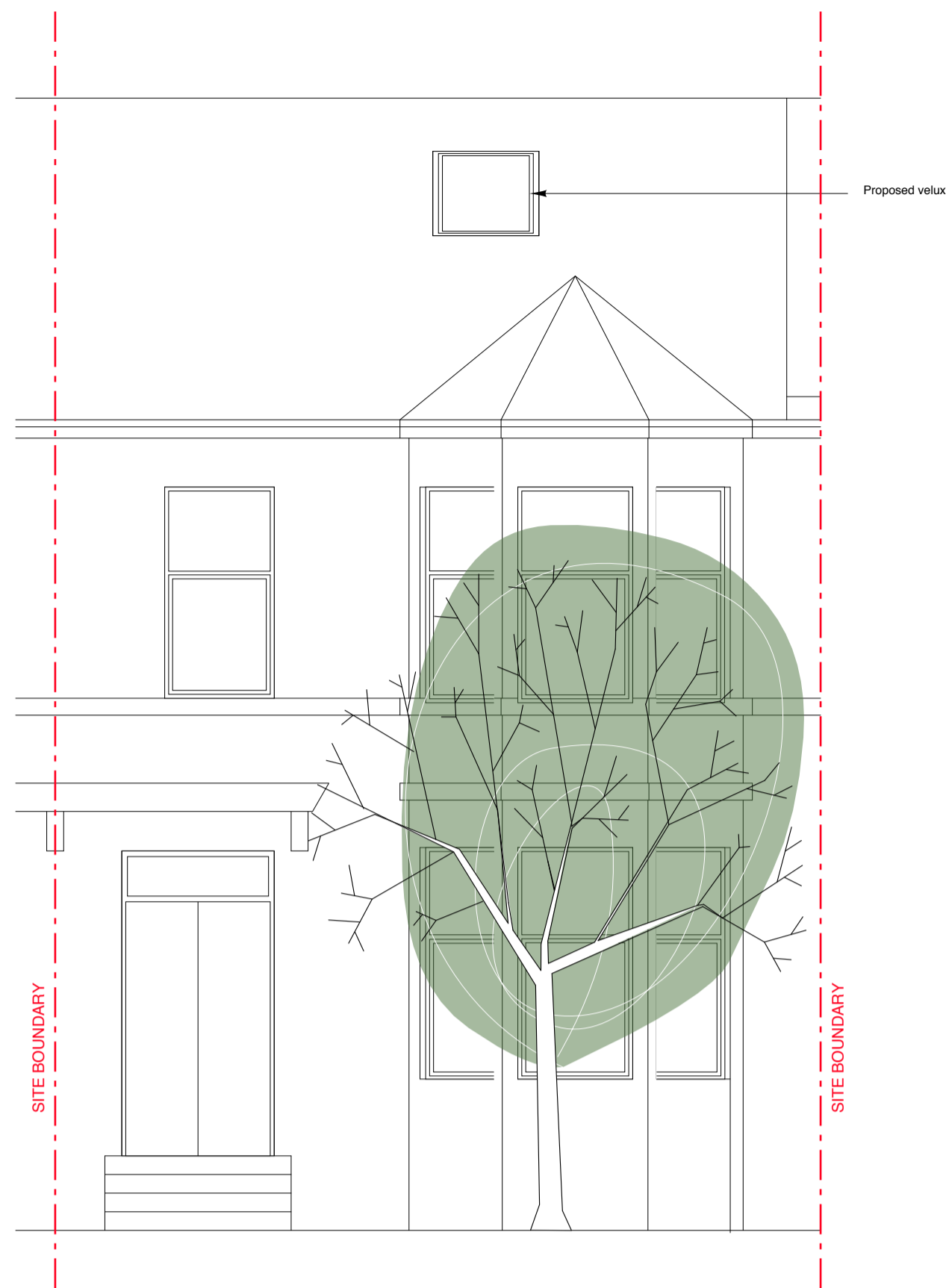
1 North East Elevation