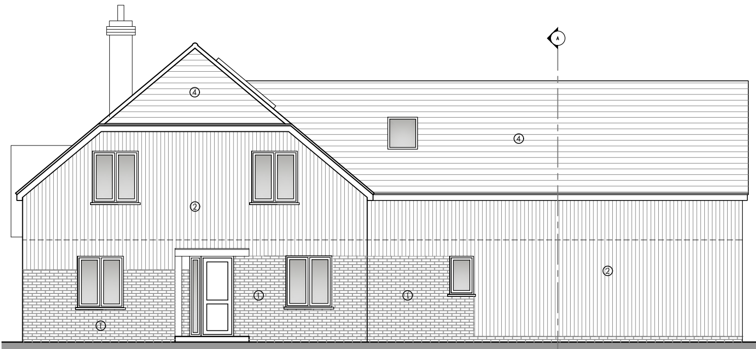
East Front Elevation