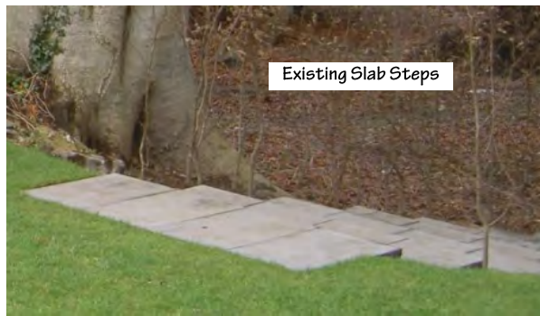
Existing Slab Steps