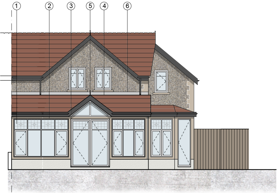
Proposed South West Elevation