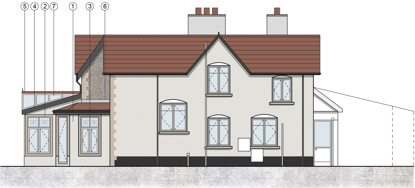
Proposed South East Elevation