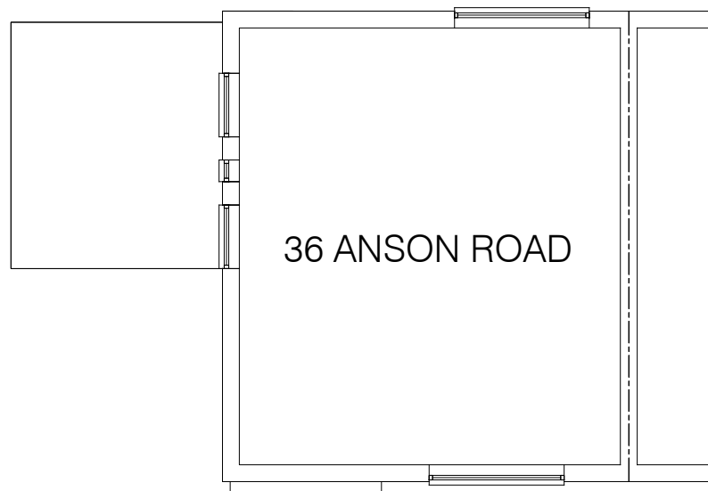
Existing First Floor Plan

Notes All dimensions must be checked on site and not scaled from this drawing, any discrepancies to be reported The Contractor shall make a survey of the site and shall be responsible for obtaining all dimensions and levels necessary for the proper construction of works as indicated. Please note that this drawing is COPYRIGHT and shall not be used or copied for purposes un-authorised by Innovation Architecture Ltd. Ordinance Survey - 100059706