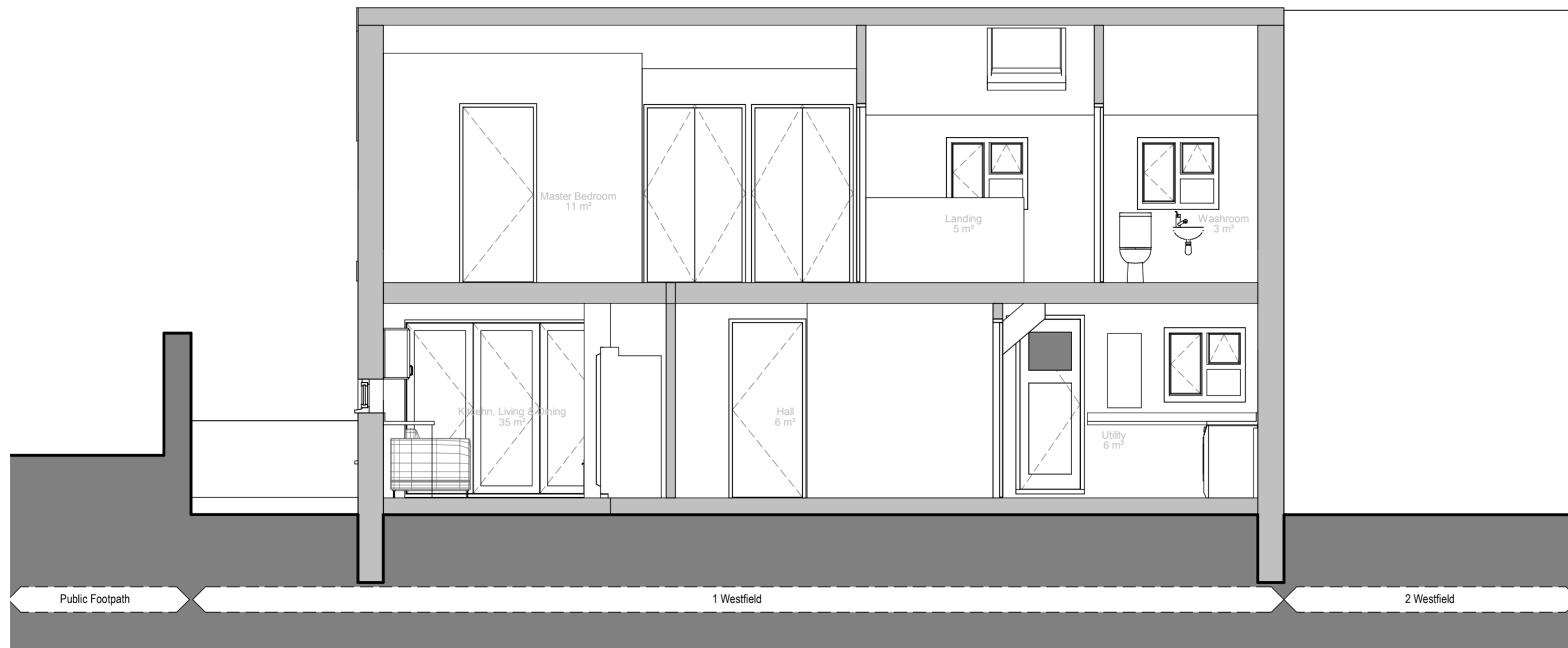
Section 01 1 : 50