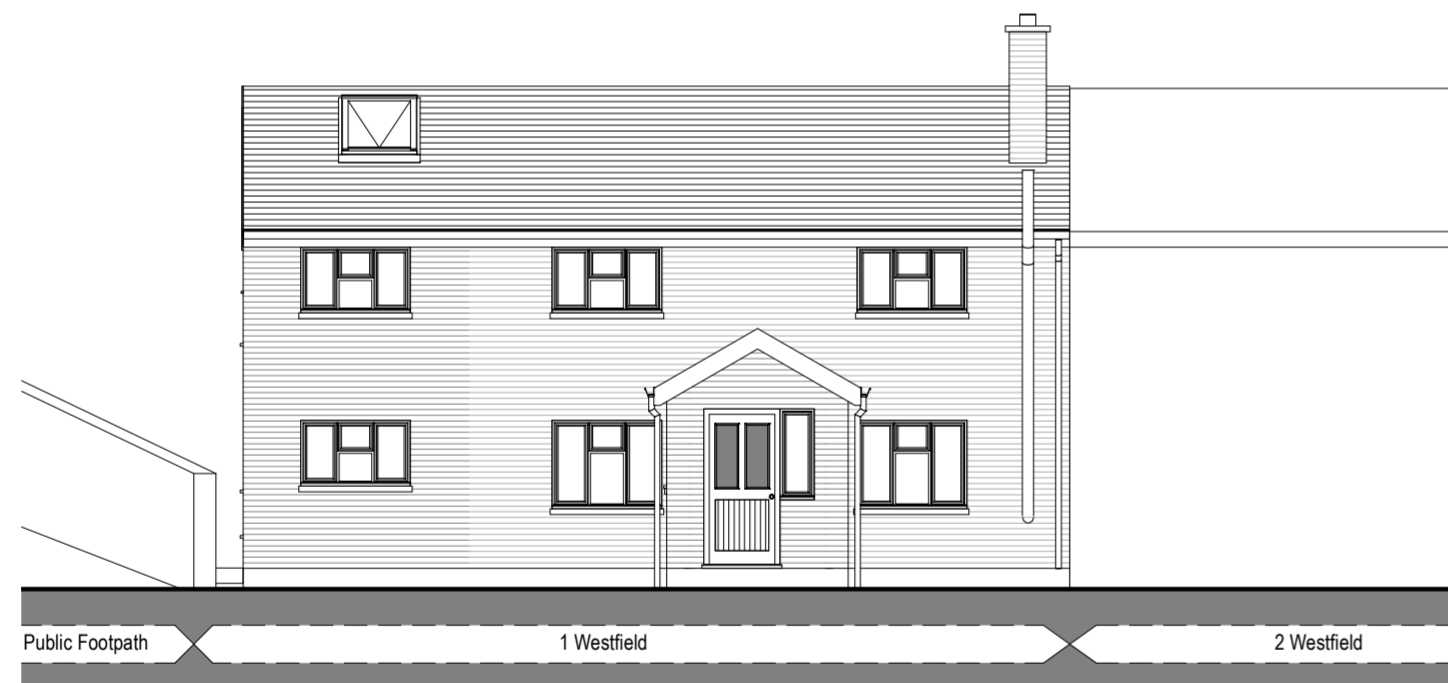
Proposed South 1 : 100