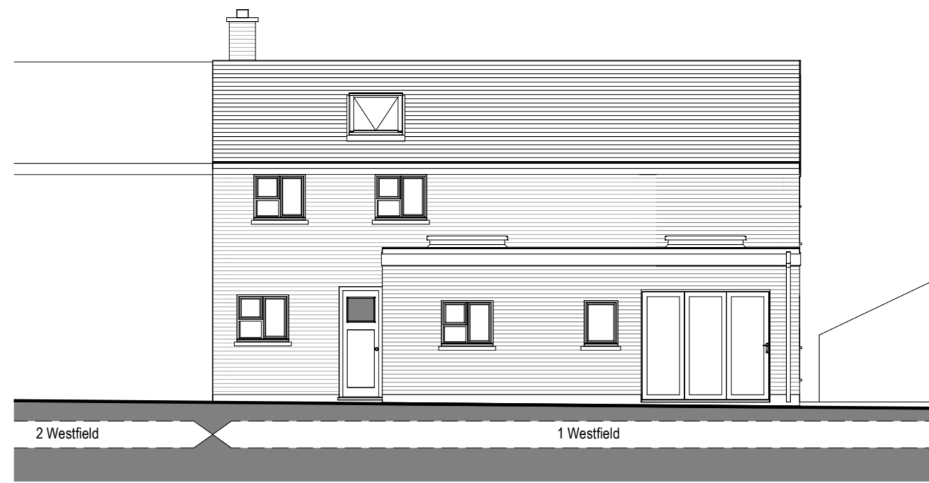
Proposed North 1 : 100