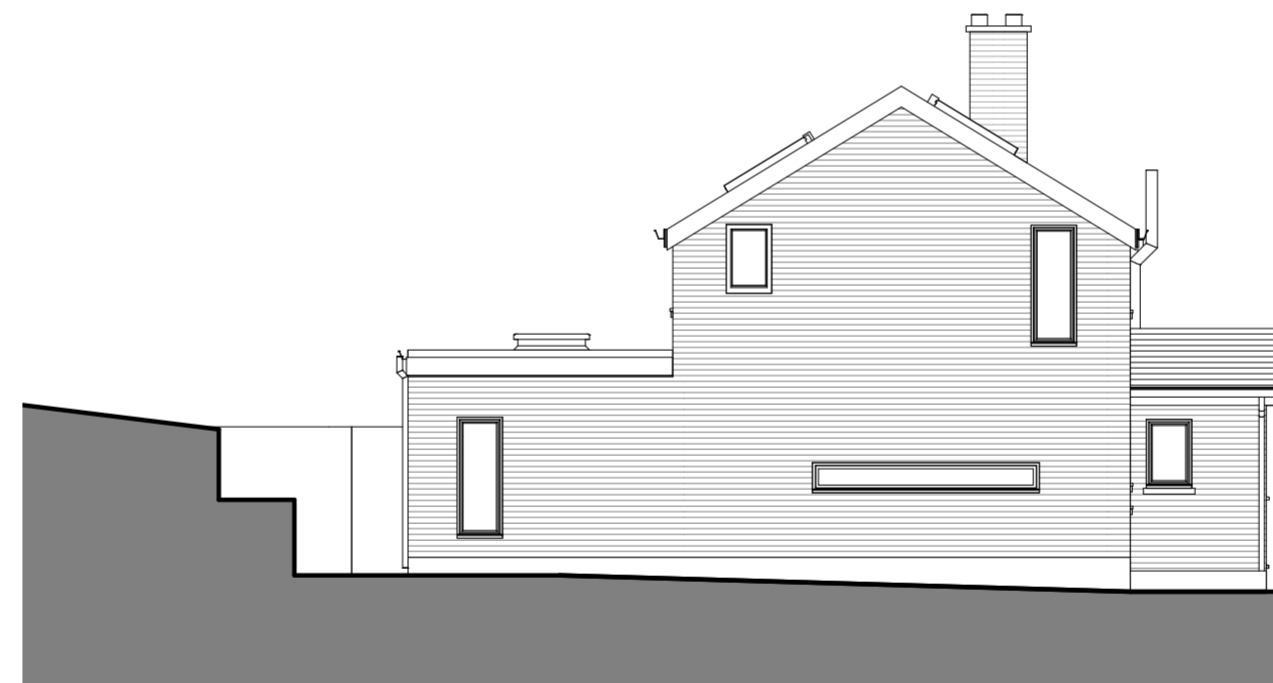
Proposed West 1 : 100