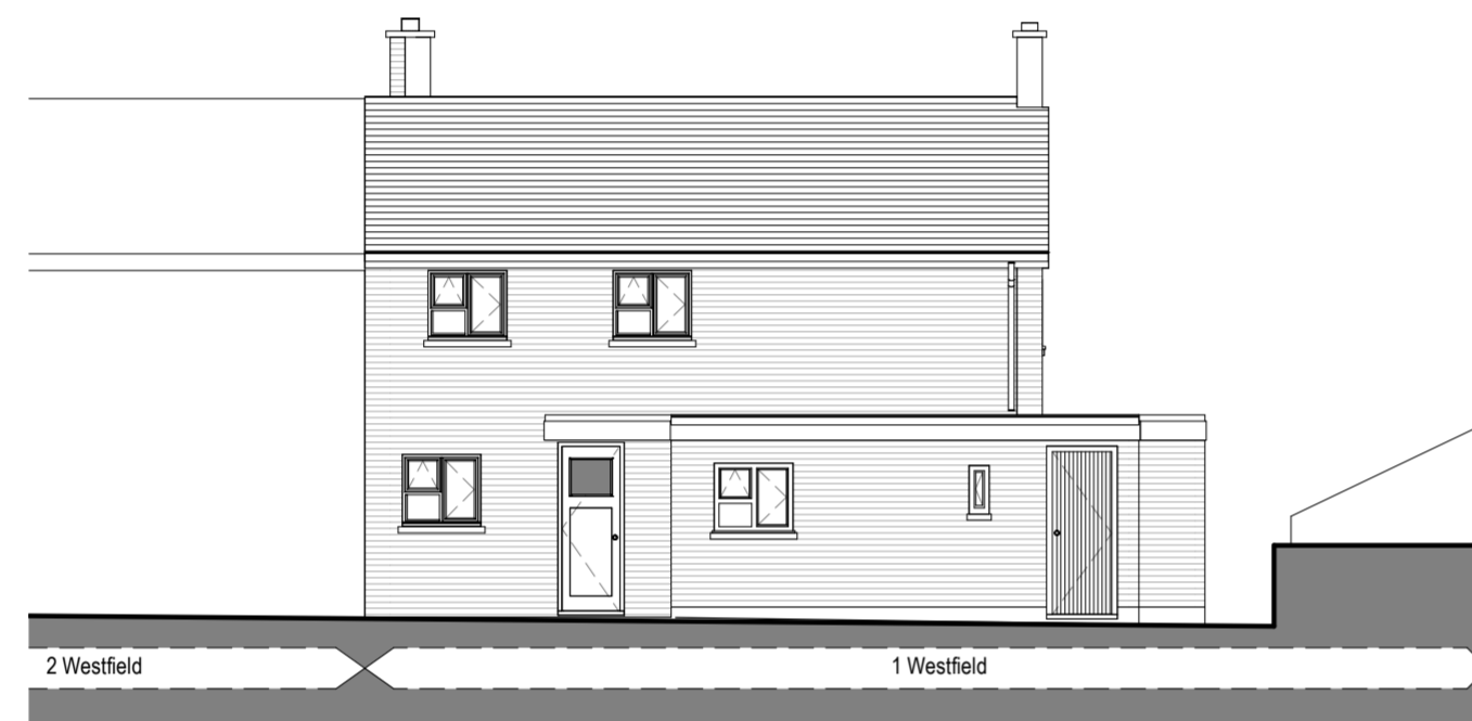
Existing North 1 : 100