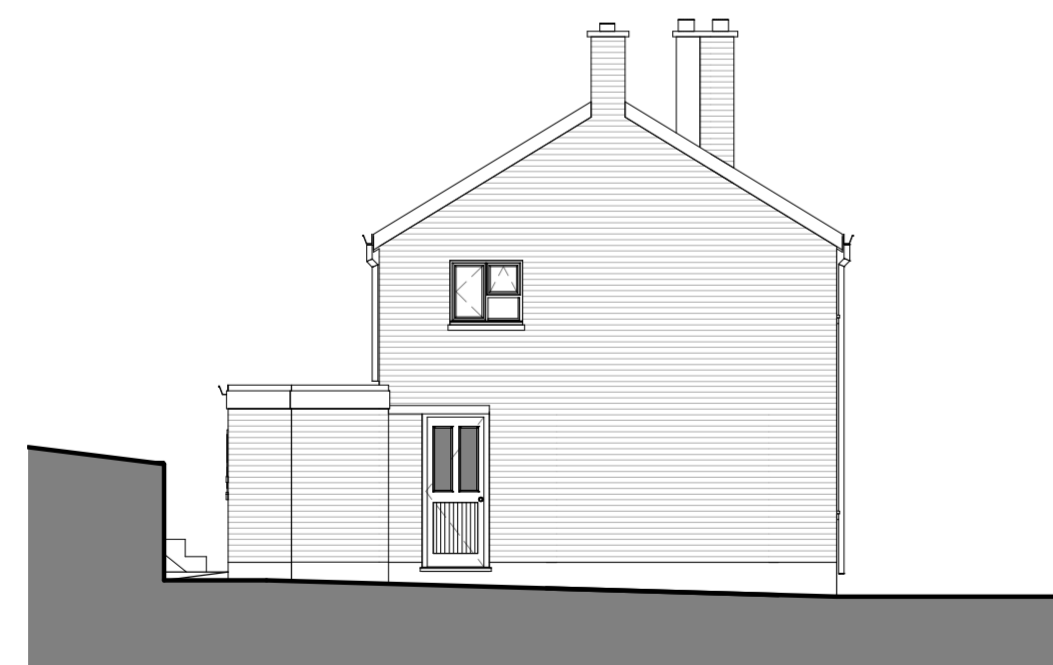
Existing West 1 : 100