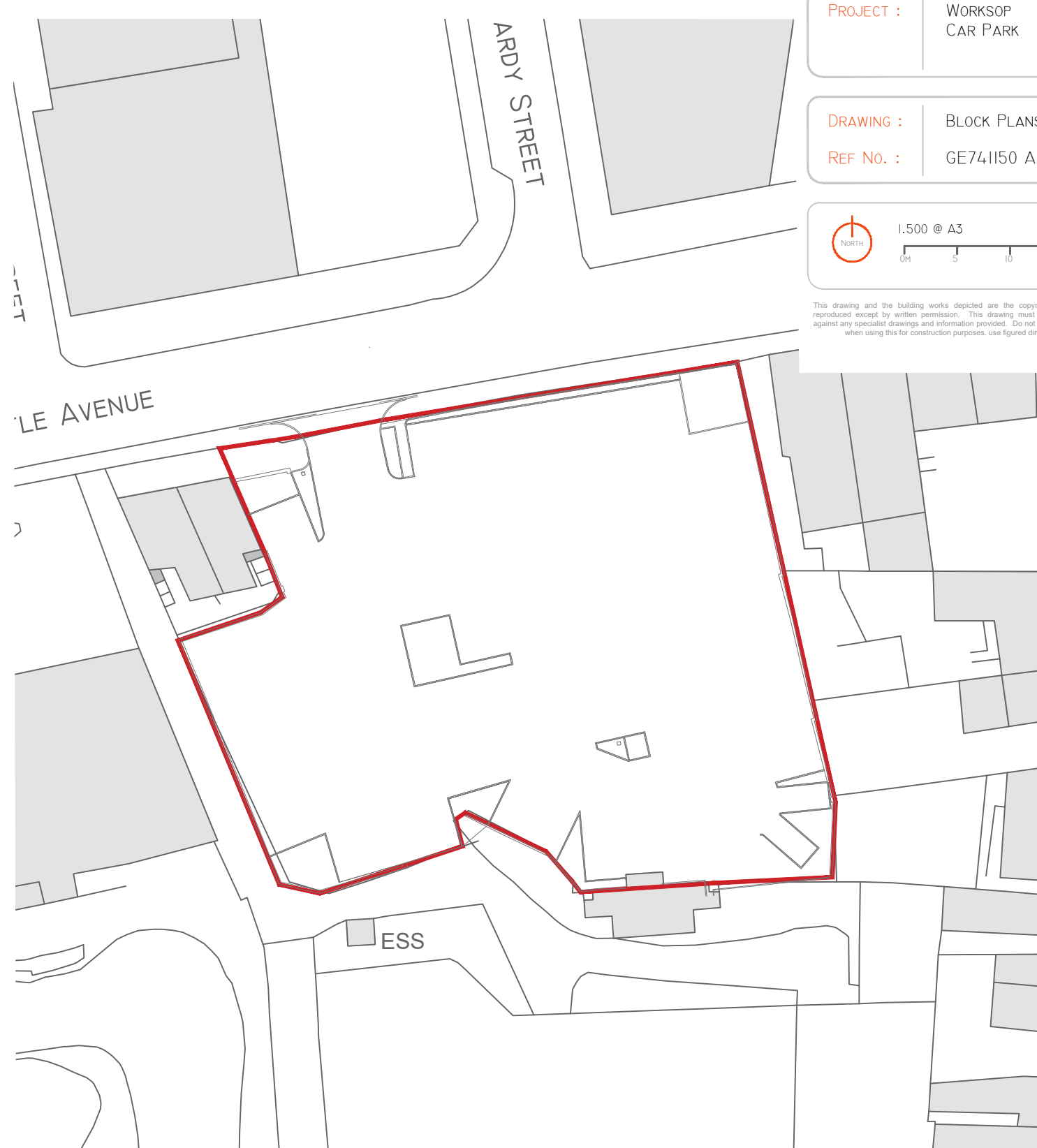
PROPOSED BLOCK PLAN : 1:500 @ A3

This drawing and the building works depicted are the copyright and may not be reproduced except by written permission. This drawing must be read and checked against any specialist drawings and information provided. Do not scale from this drawing when using this for construction purposes, use figured dimensions only.