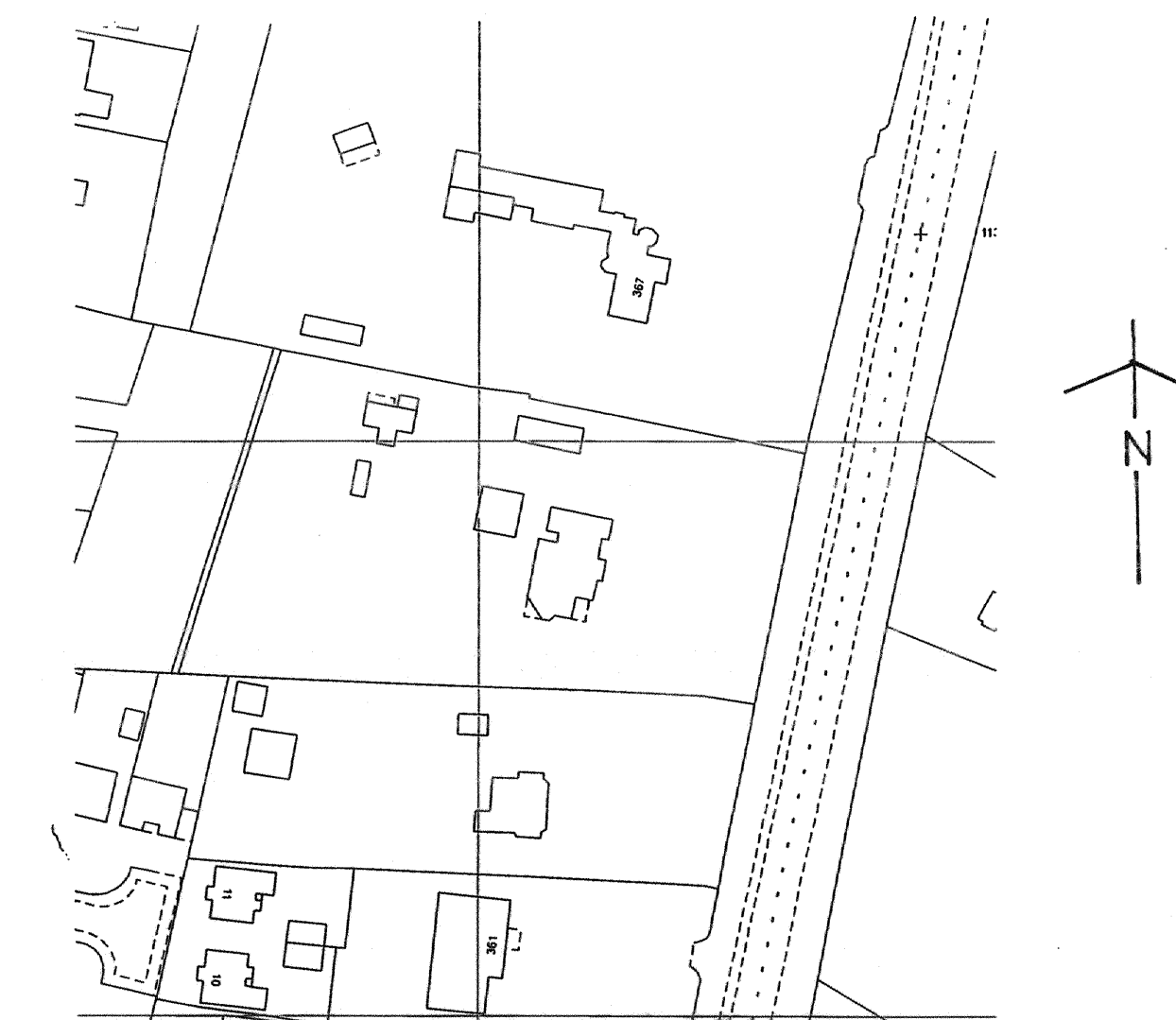
site location plan scale 1/1250