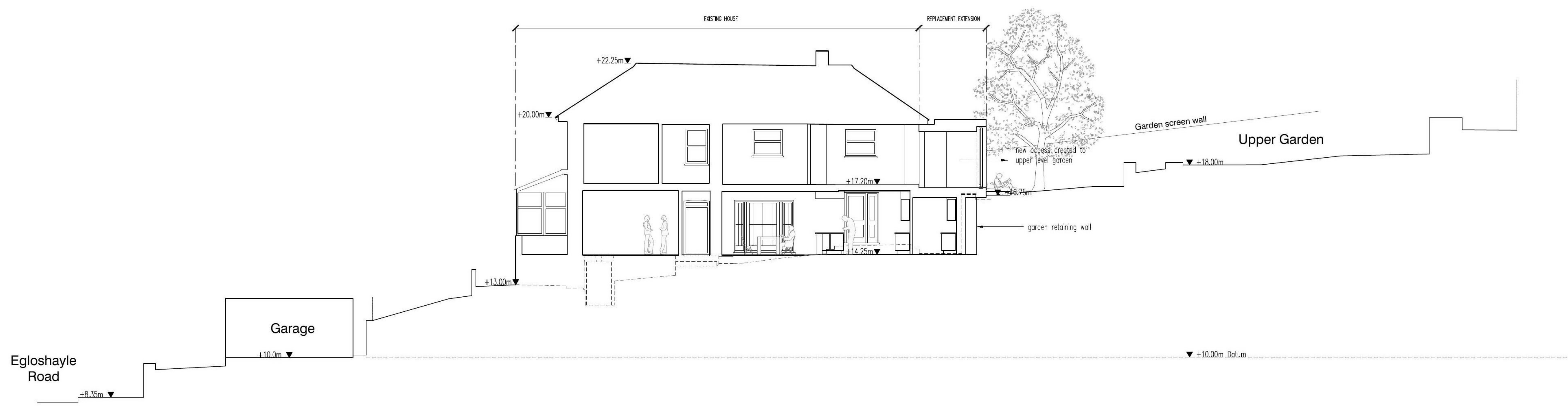
02 SITE SECTION - PROPOSED SCALE 1: 100@A1 | 1:200@A3