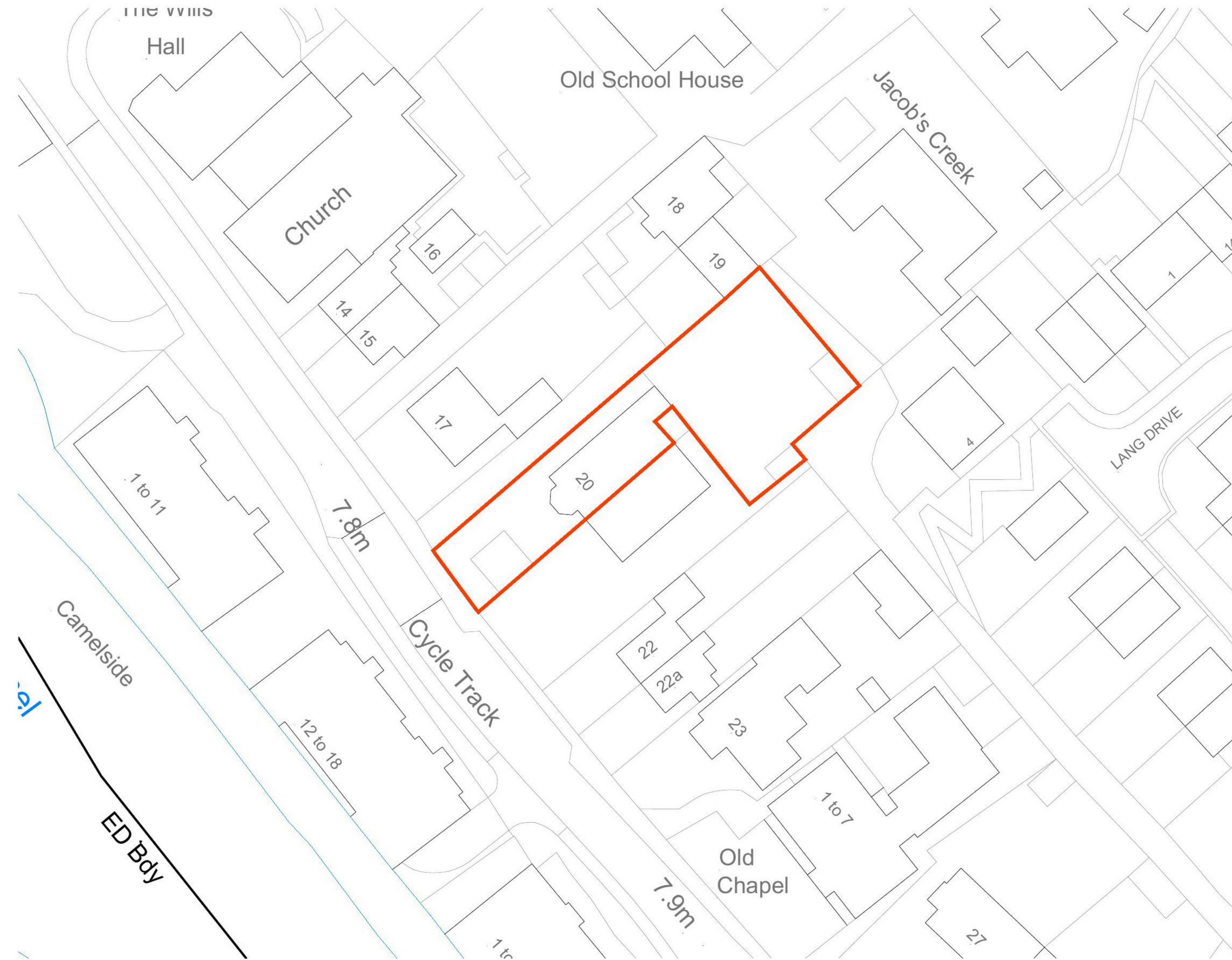
01 BLOCK PLAN SCALE 1: 1:500@A1; 1:250@A3