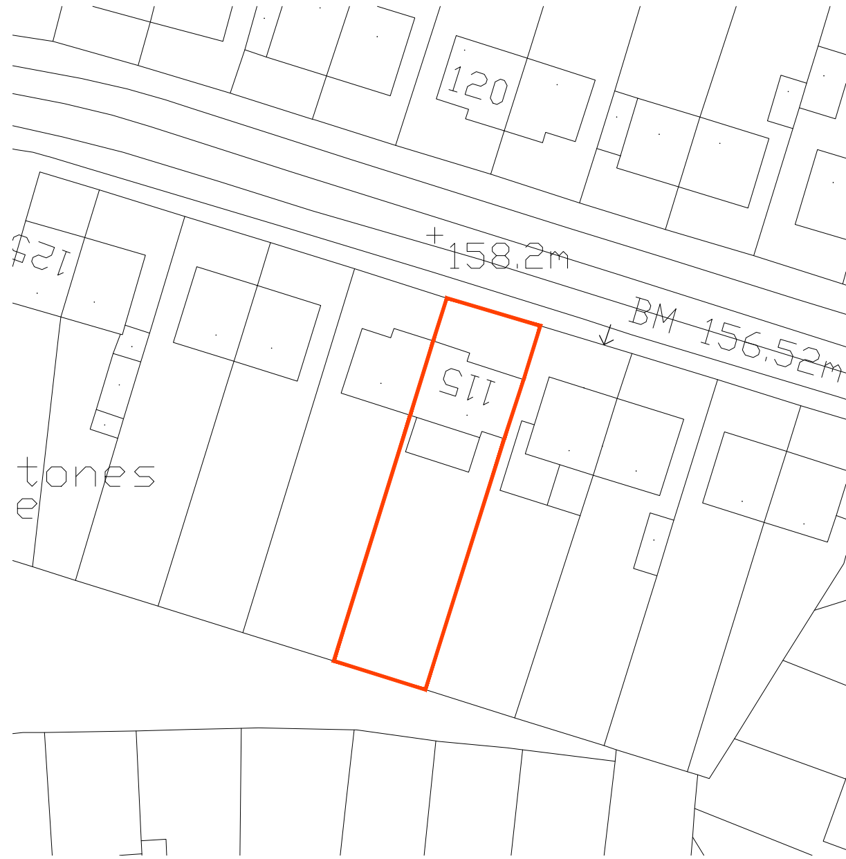
PROPOSED SITE-LOCATION PLAN SCALE 1:500@A3

client MR & MRS CONNETT project 115 GREYSTONES ROAD SHEFFIELD S11 7BS