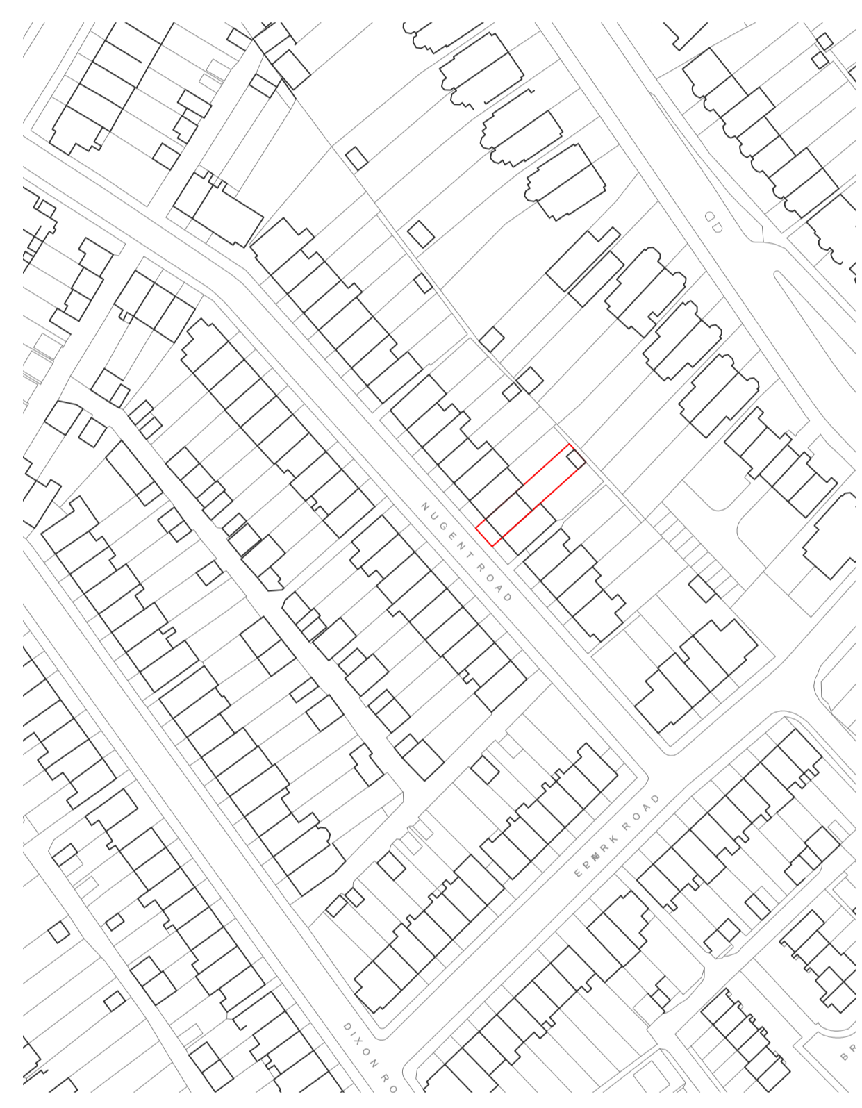
Location Plan 1:1250 @ A1

Unless indicated otherwise, this drawing is for information only. Do not scale from this drawing. Use figured dimensions only. Figured dimensions are in millimetres except where indicated otherwise. All levels are in metres. All dimensions and levels shall be verified on site before proceeding with works and such dimensions are to be the responsibility of the contractor. Report all drawing errors and omissions to the architect. Where building components are described in the specification as contractor designed, 'construction' information relating to those components on this drawing represents design intent only. © commonbond 2020