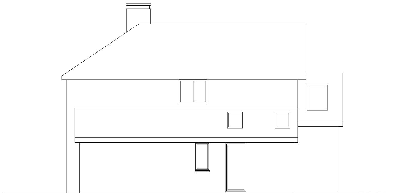
EXISTING SIDE ELEVATIONS SCALE 1:100