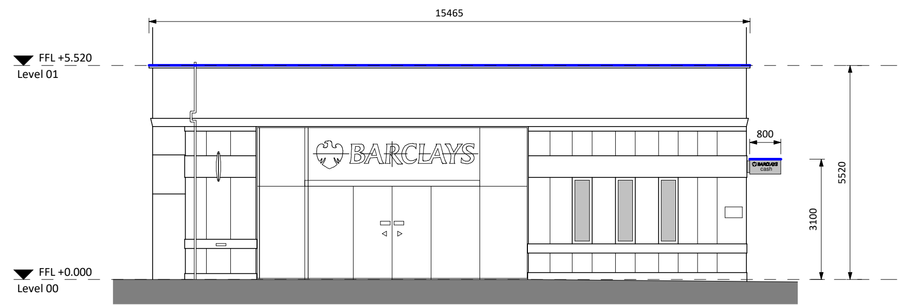
Elevation 1 - Proposed 1 : 100