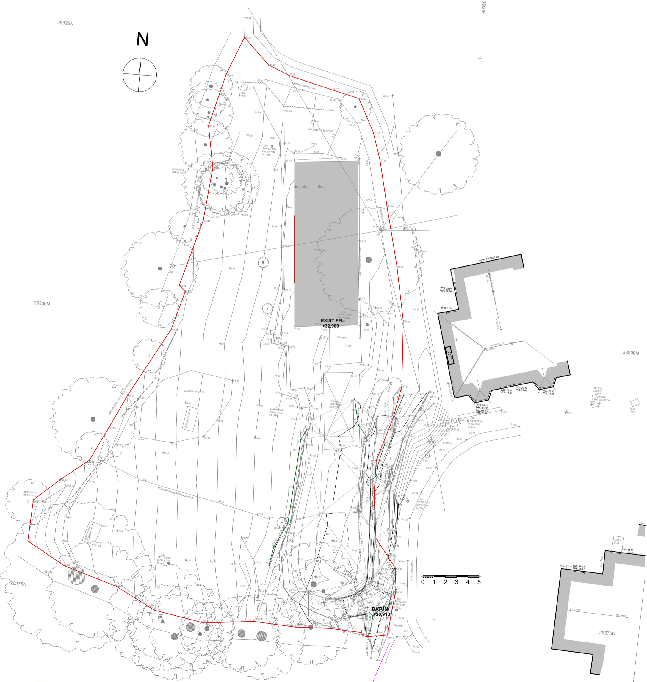
Site Survey with Model 1:200