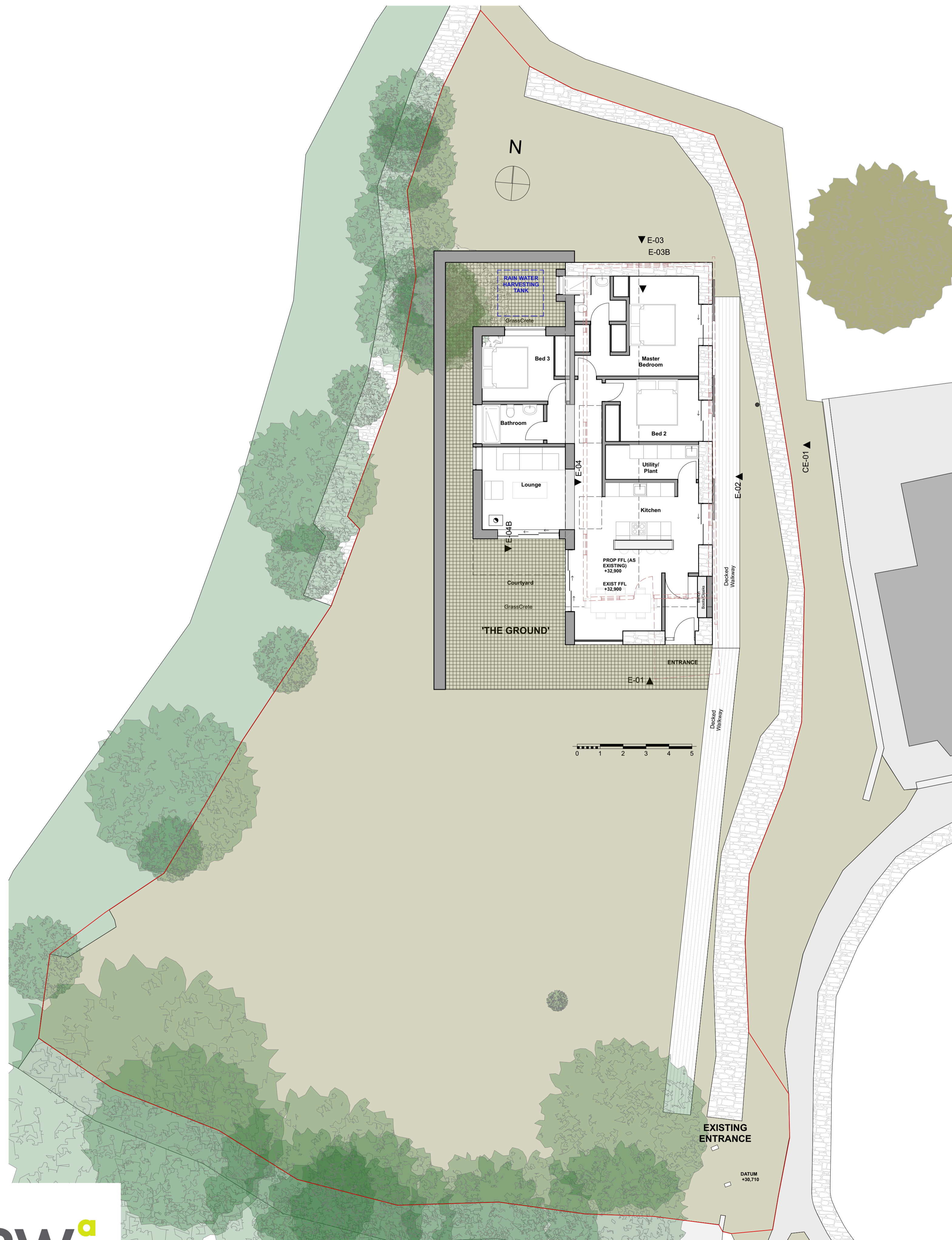
0. Proposed Site/Ground Floor Plan 1:100

Rev. A - 18/02/2021 Datum Reference and Existing Hut FFL & Proposed Building FFL Added.