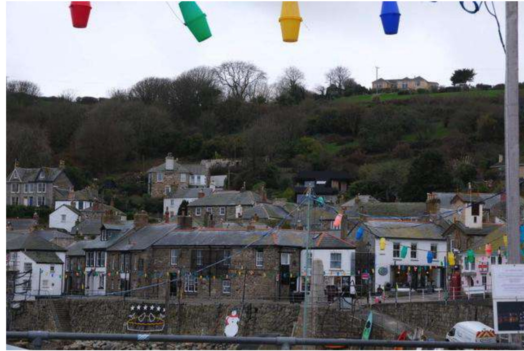
Photo from East from Harbour - As Existing