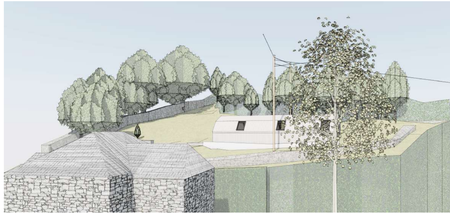
Visualisation from East - As Existing