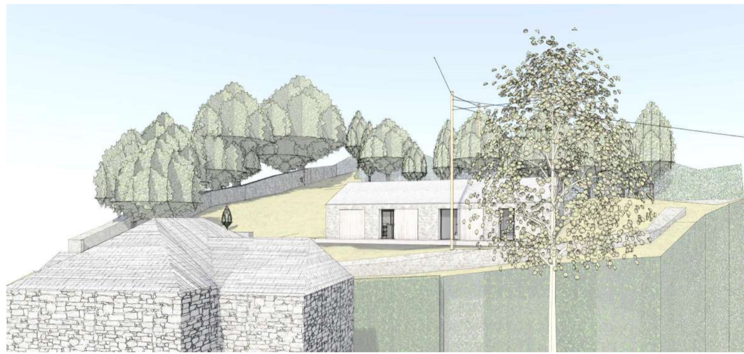
Visualisation from East - As Proposed