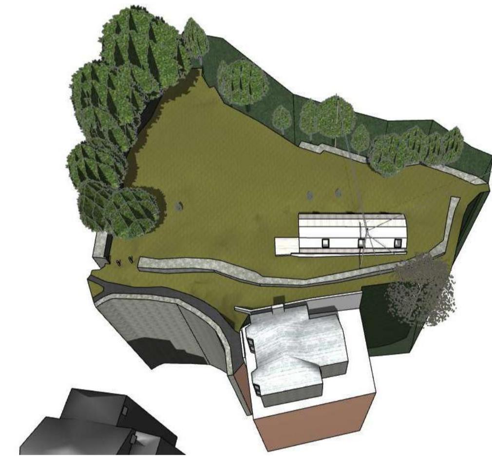
Aerial from East As Existing