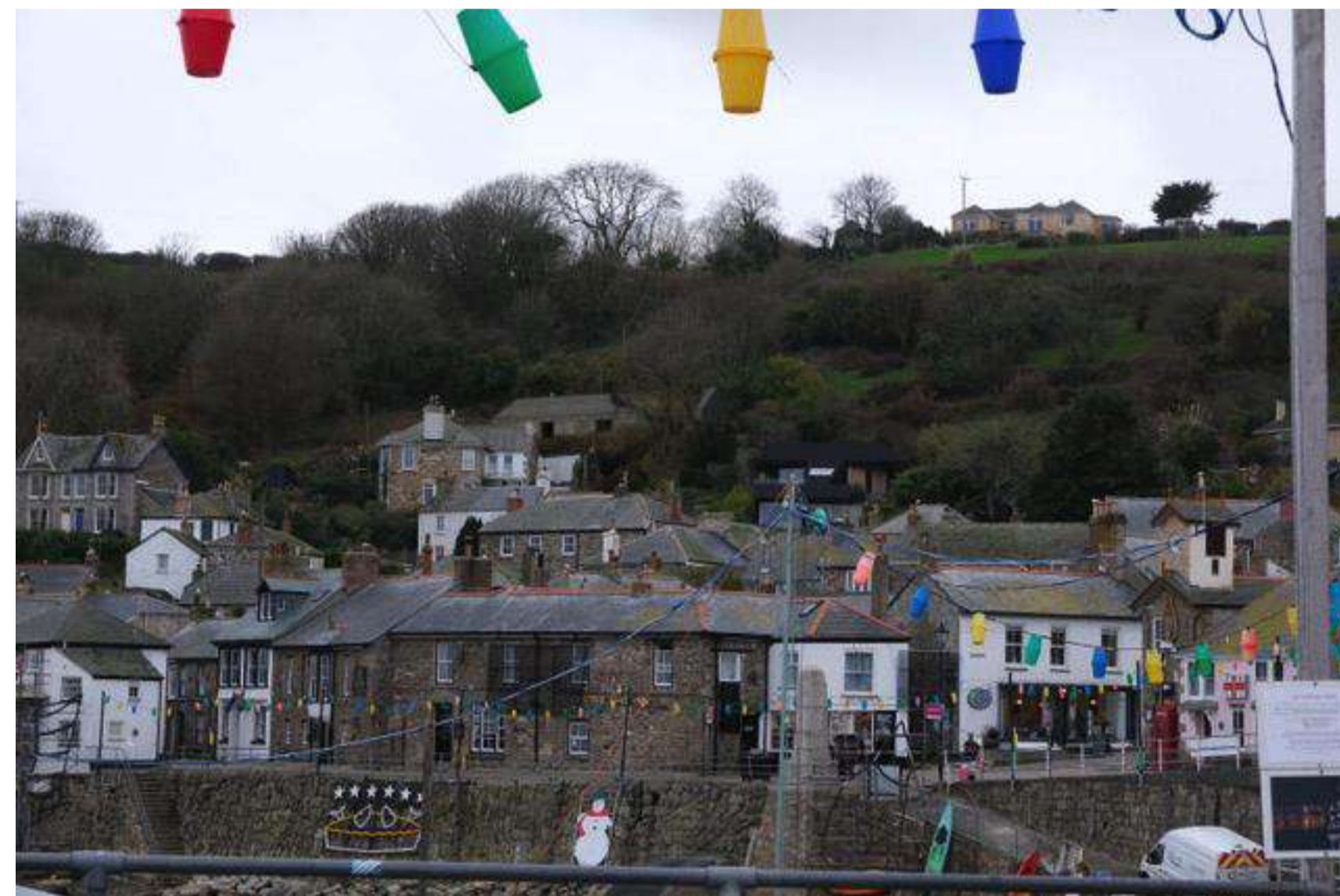
Photo Montage from East from Harbour - As Proposed