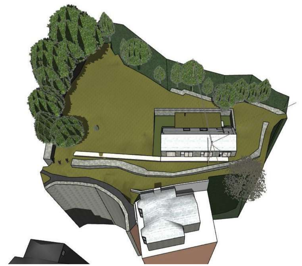
Aerial from East As Proposed