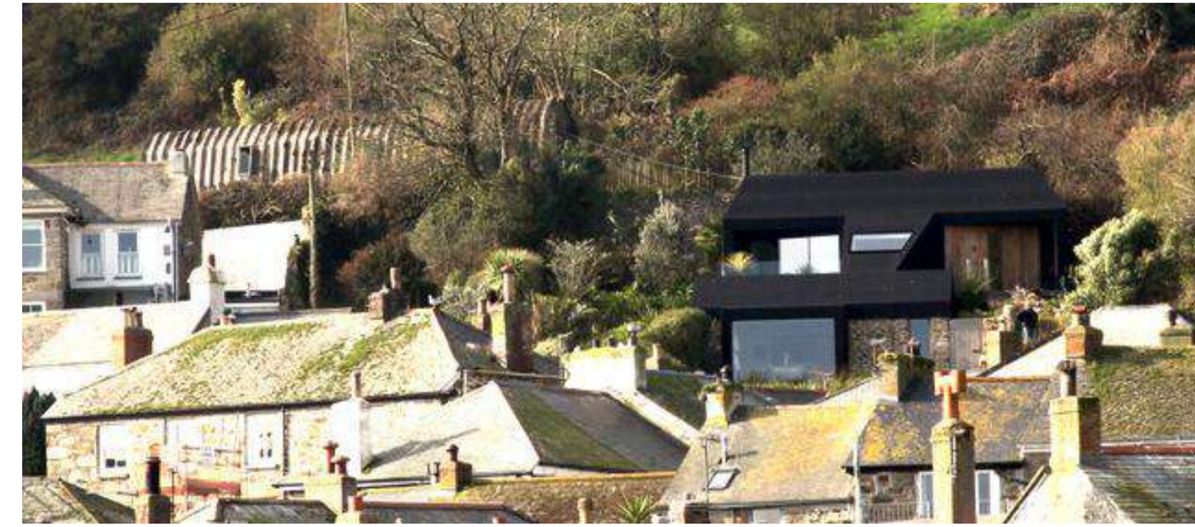
Photo from East - As Existing