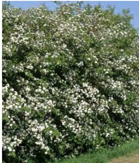
Crataegus hedge planting