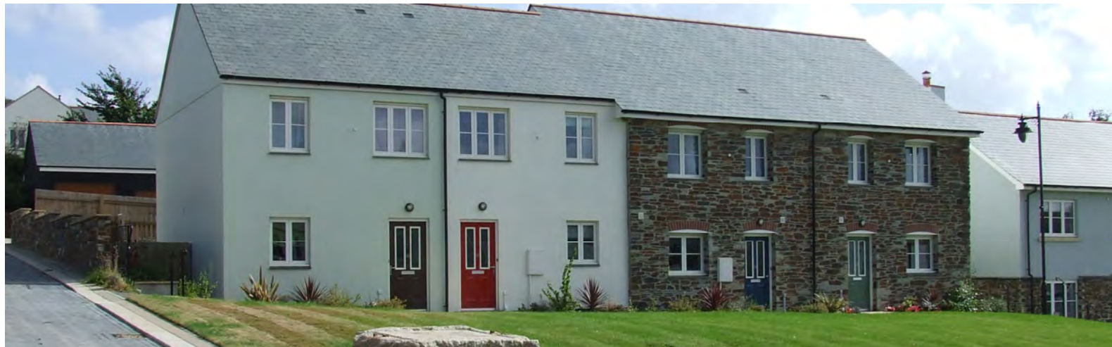
Mix of Stone and Render finishes to front