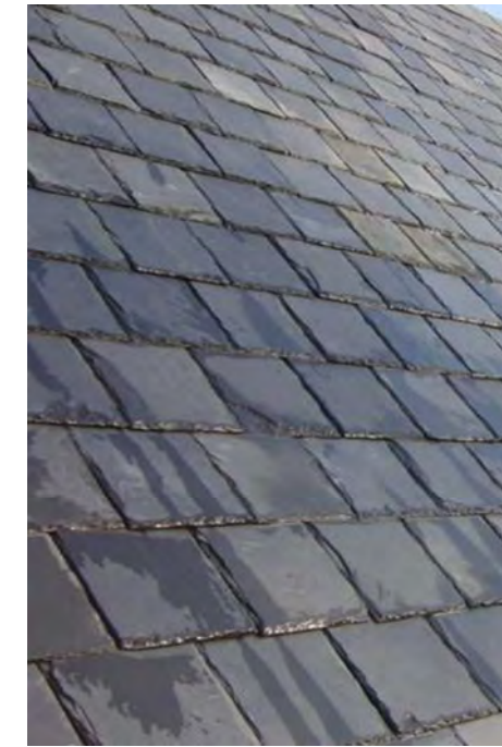
Natural Slate roof covering