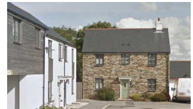
Examples of material finishes to key plots