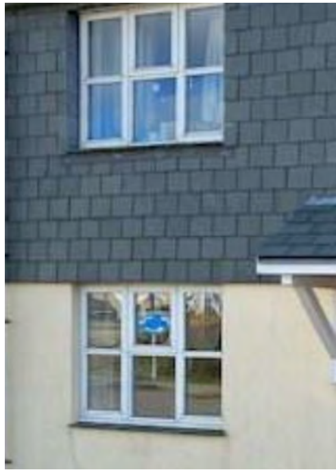
Hanging Slate and Render finish