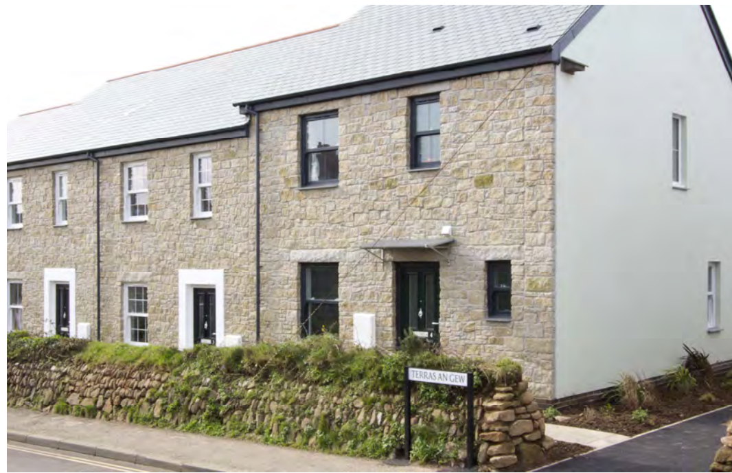
Stone frontage with Render to secondary elevations