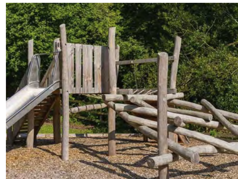
Natural play equipment for LAP

Gilbert & Goode Gilbert & Goode Stennack House Stennack Road St Austell Cornwall PL25 3SW 01726 64800