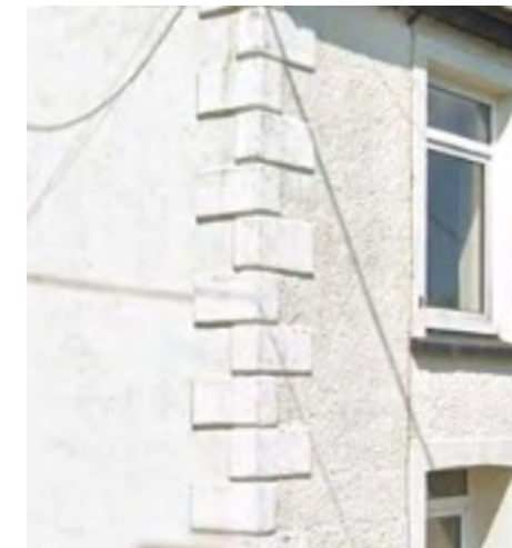
Render with Quoins