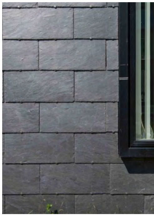
Hanging Natural Slate