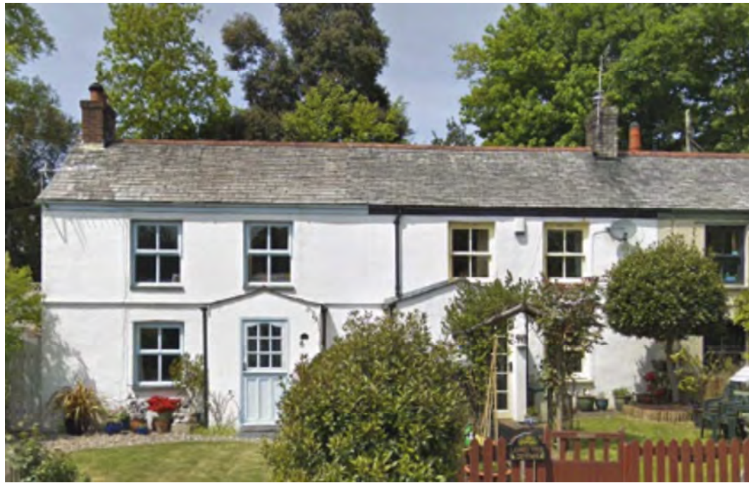
Traditional rendered Cornish cottages with Slate roof