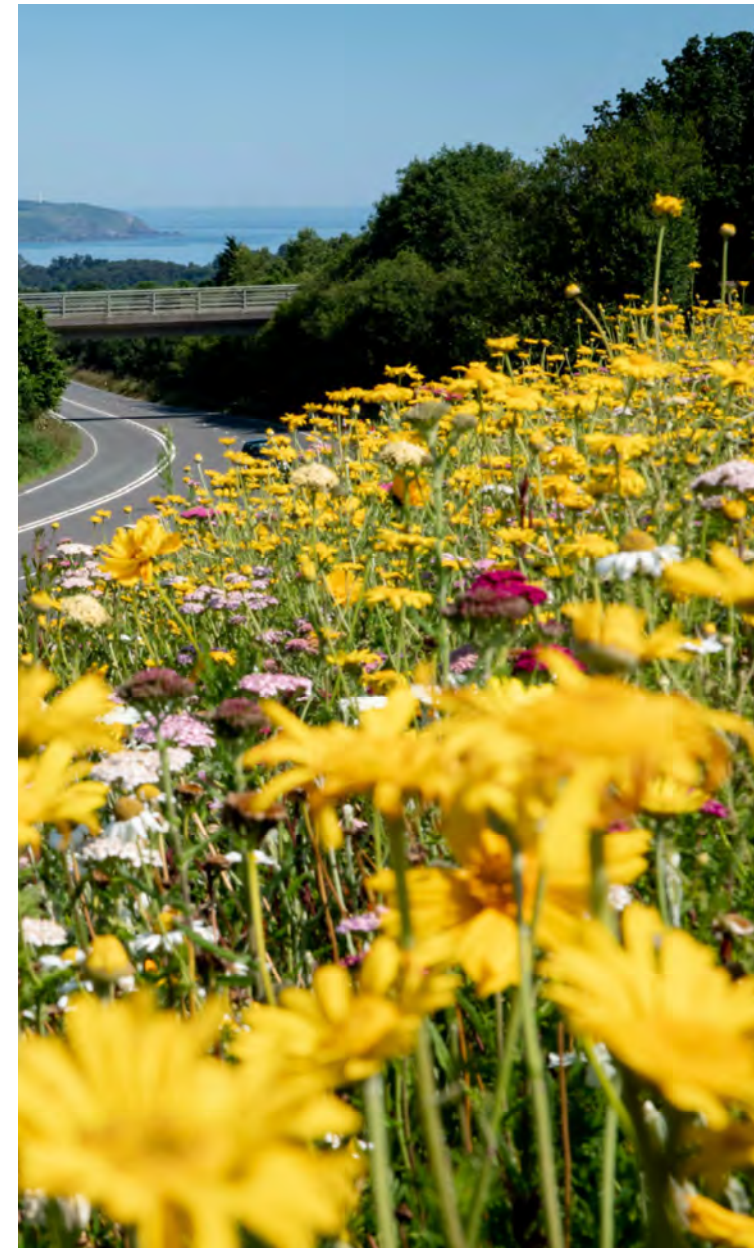
Wild meadow flower planting to nearby A391