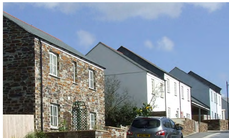
Mix of Stone and Neutral Render colours on street elevation