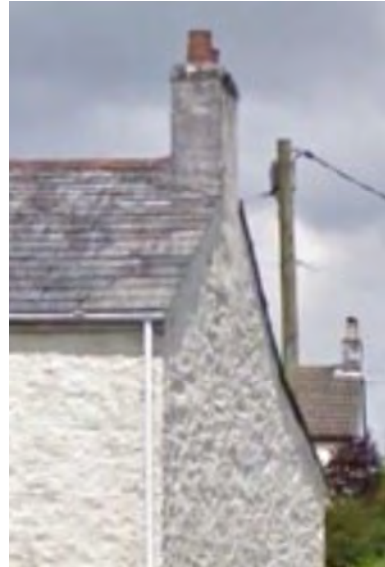
Chimneys to gable ends