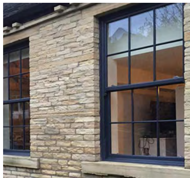
Sash windows with Stone façade