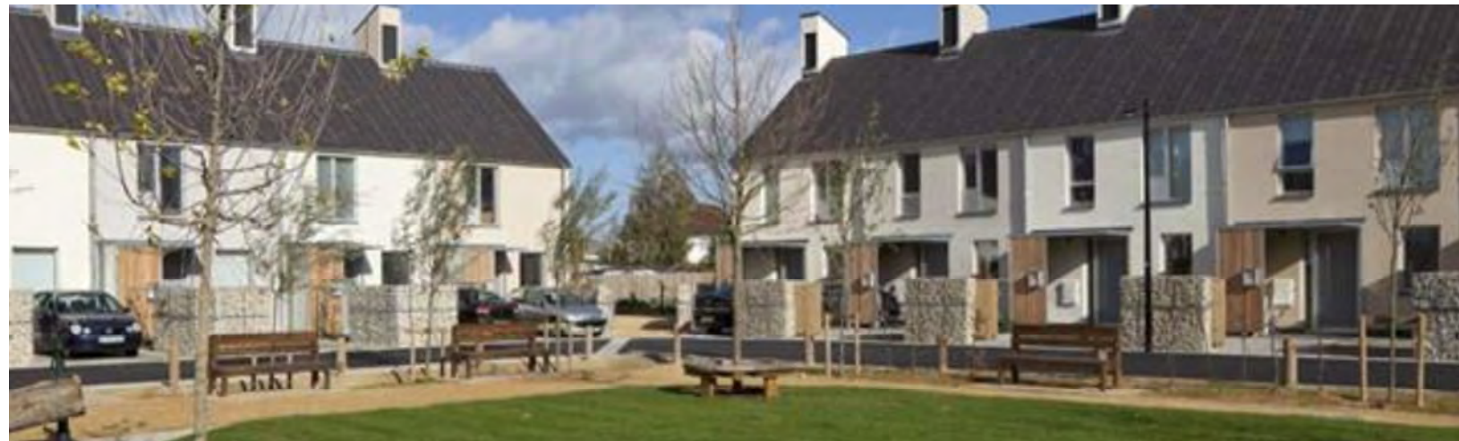
Feature plots to POS