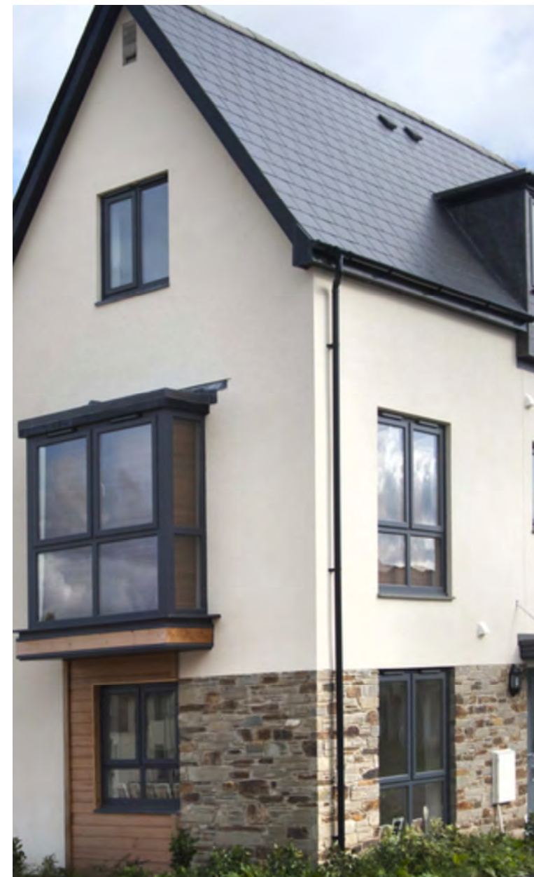
Stone and Render used to highlight key