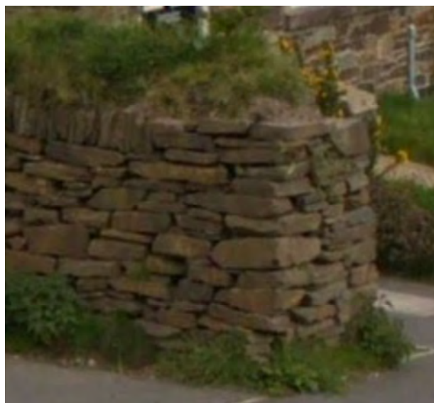
Traditional Cornish Hedgebank