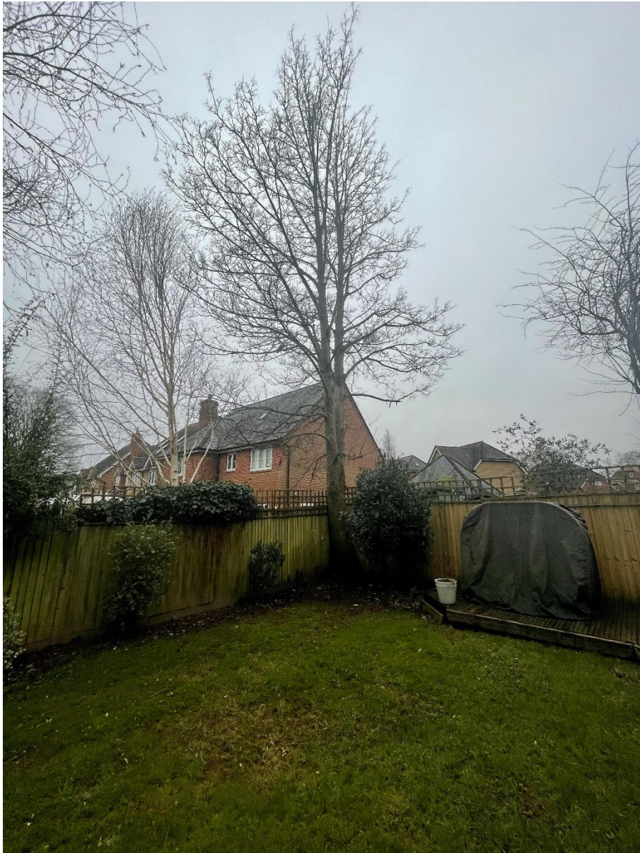
Sycamore to be felled