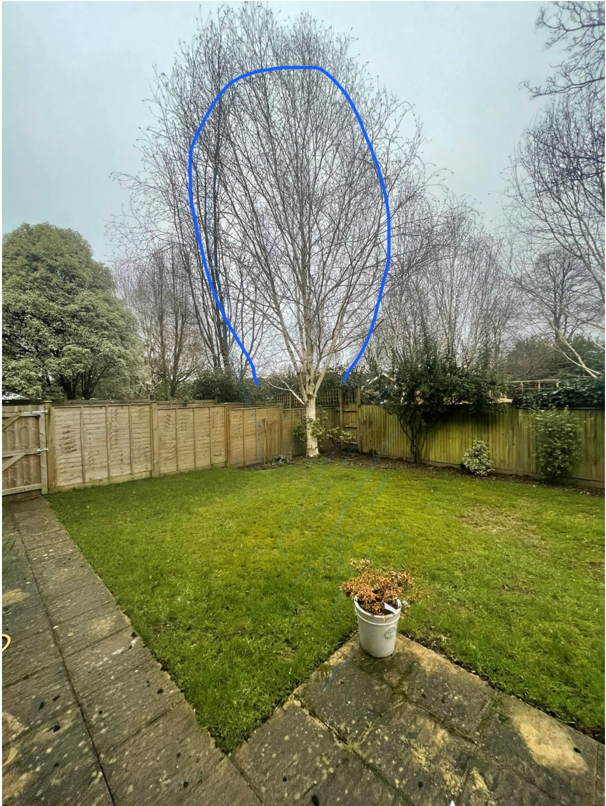
Silver birch to be reduced to line.