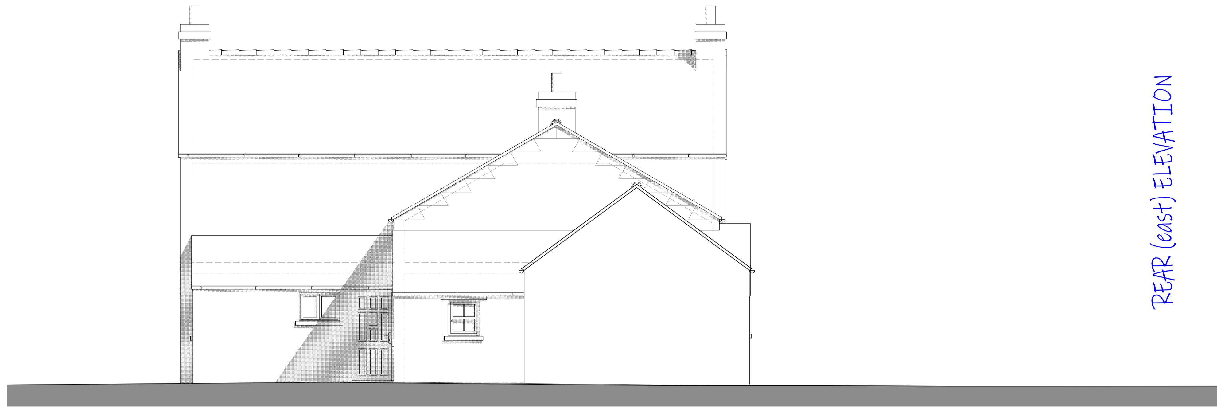
REAR (east) ELEVATION