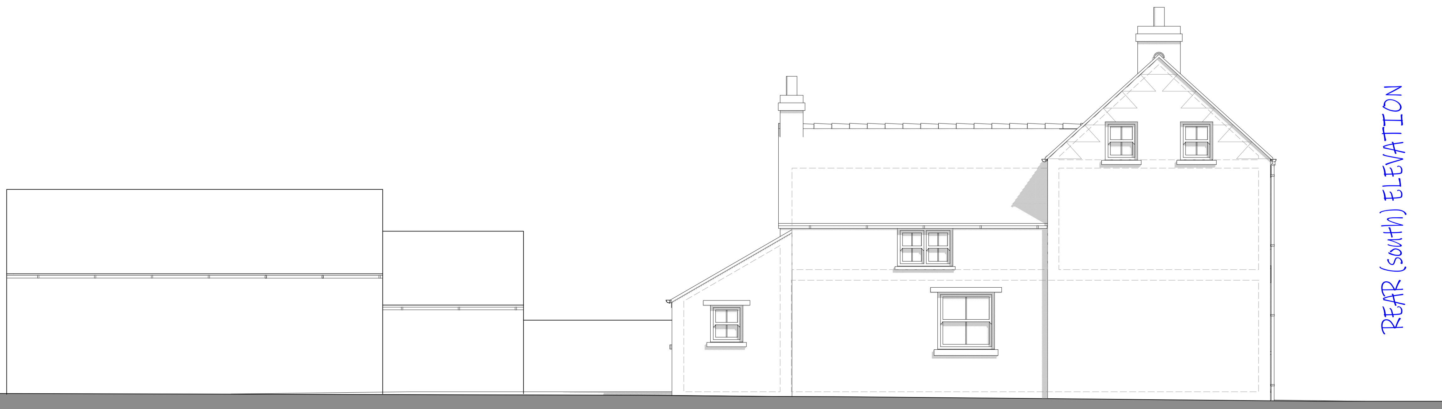
REAR (south) ELEVATION