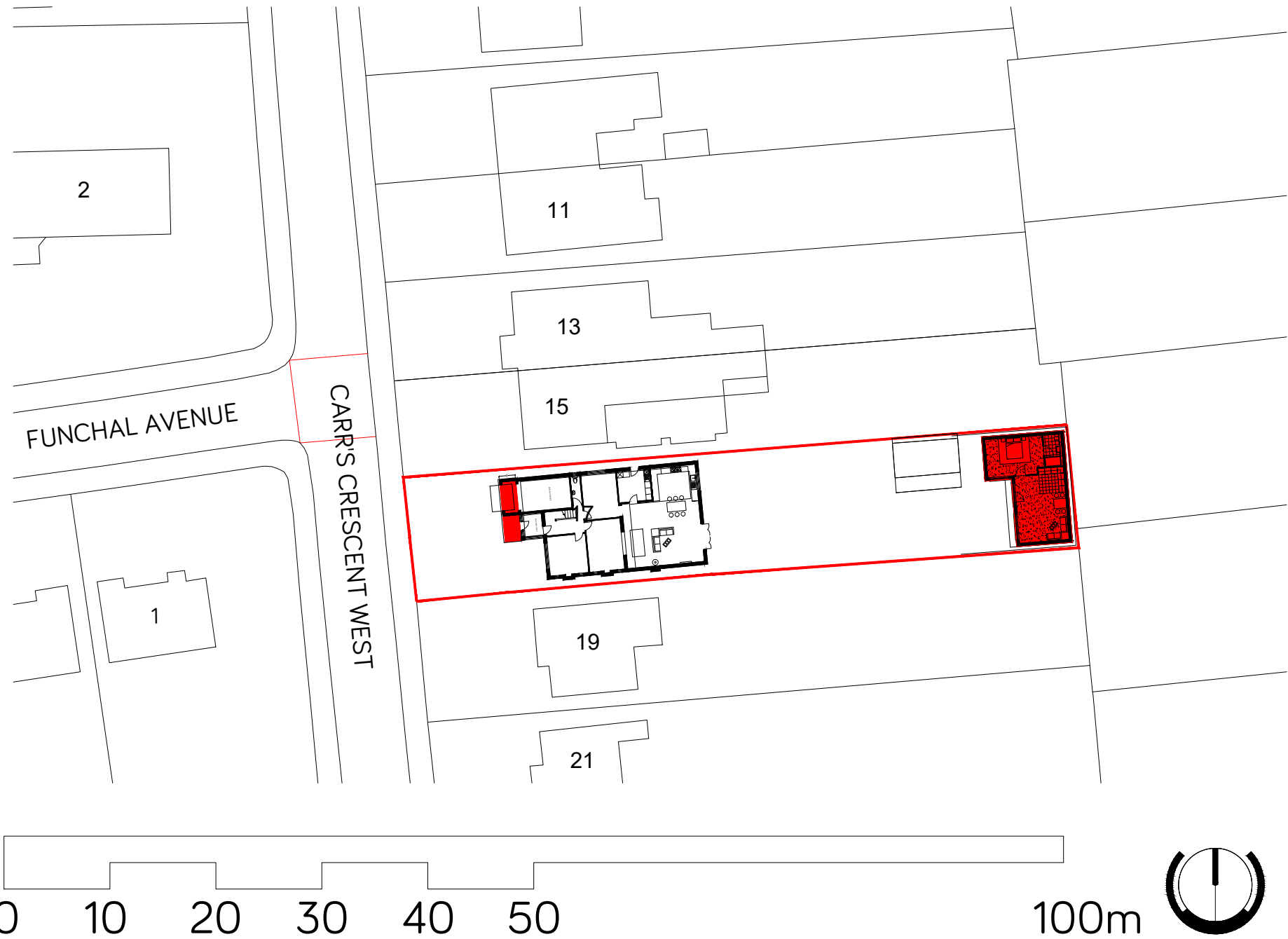
Site Plan Scale 1:1250

graham coule - architect mobile 07498 298775 email - shoresidearchitect@btinternet.com