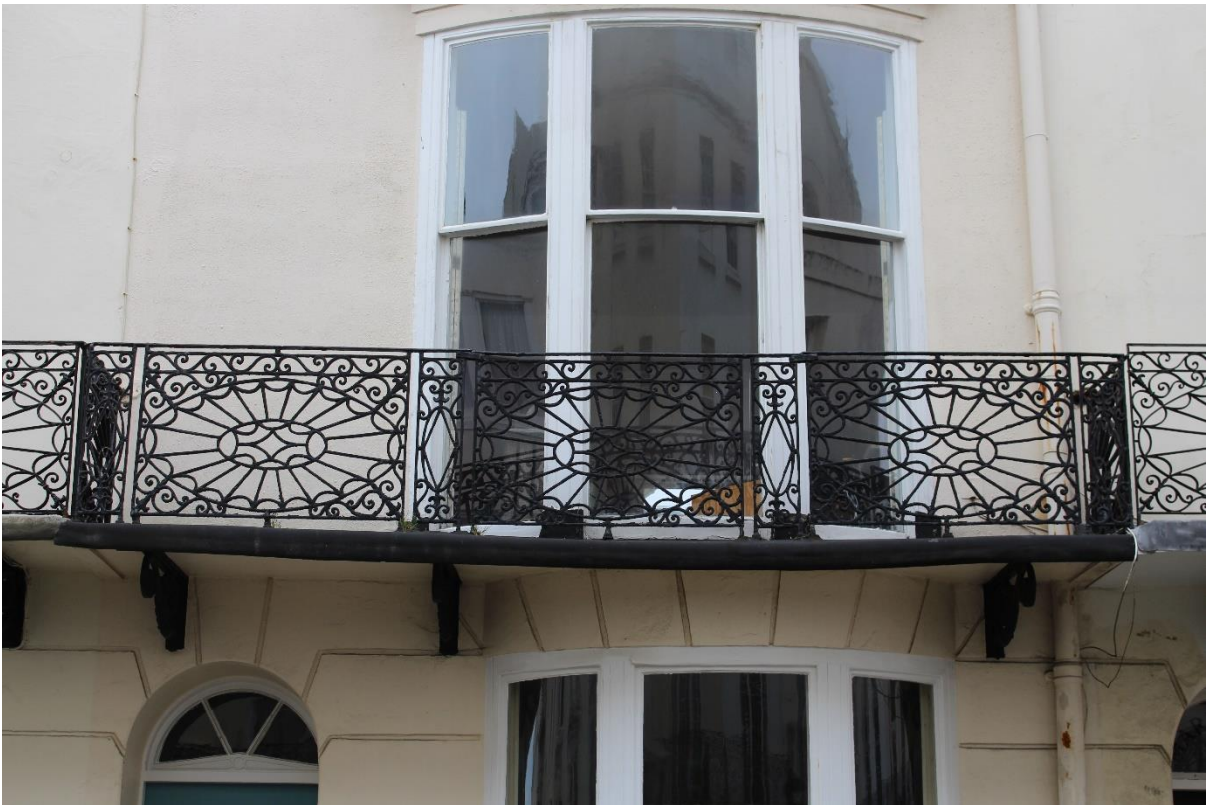
Number 10 Bloomsbury Place, View of Railings