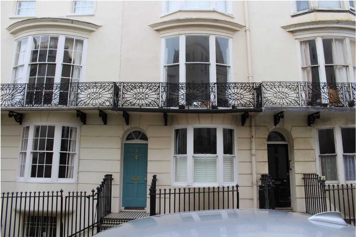
Number 10 Bloomsbury Place, View of Railings