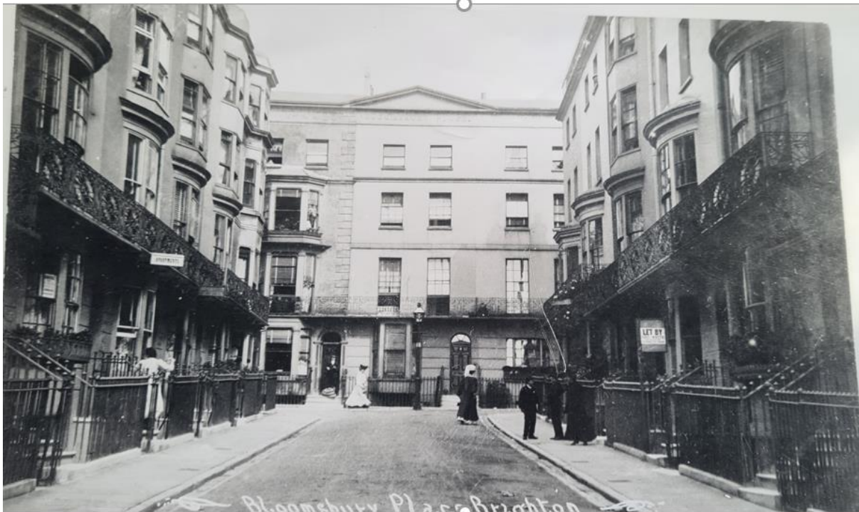
Number 10 Bloomsbury Place, Historic Photograph

The applicant has owned the maisonette since 2008, and is also the freeholder of the whole building which includes 10b basement apartment.