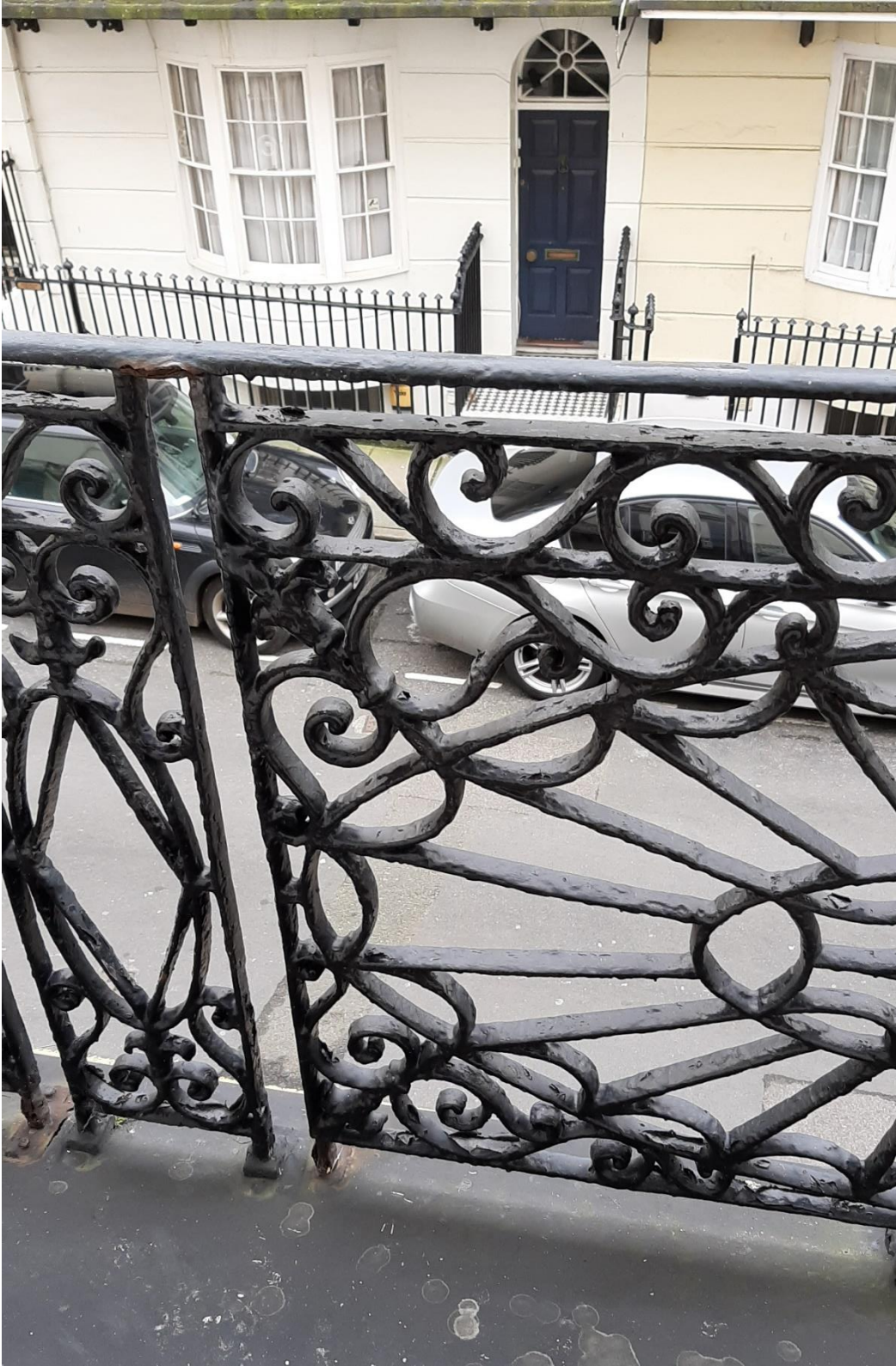
Number 10 Bloomsbury Place, View of Railings/Asphalt