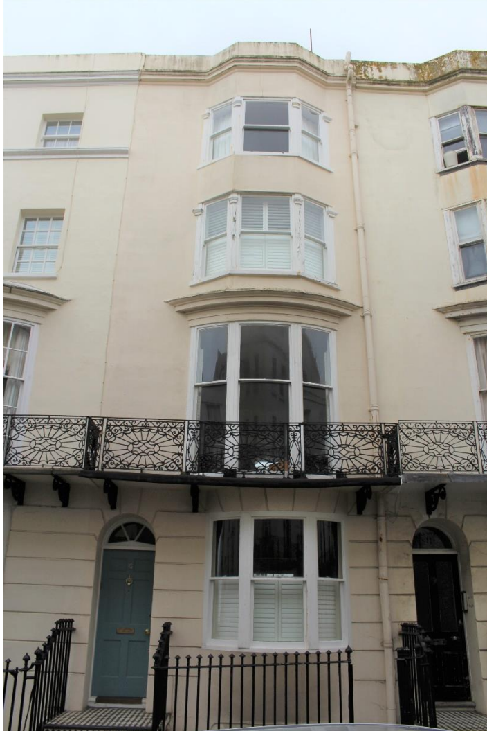
Number 10 Bloomsbury Place, Facade