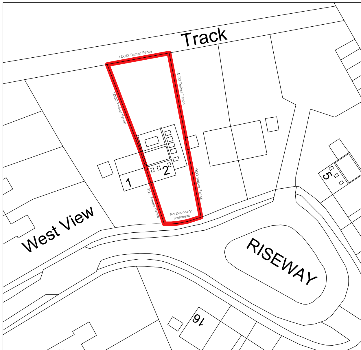
Site Plan As Proposed