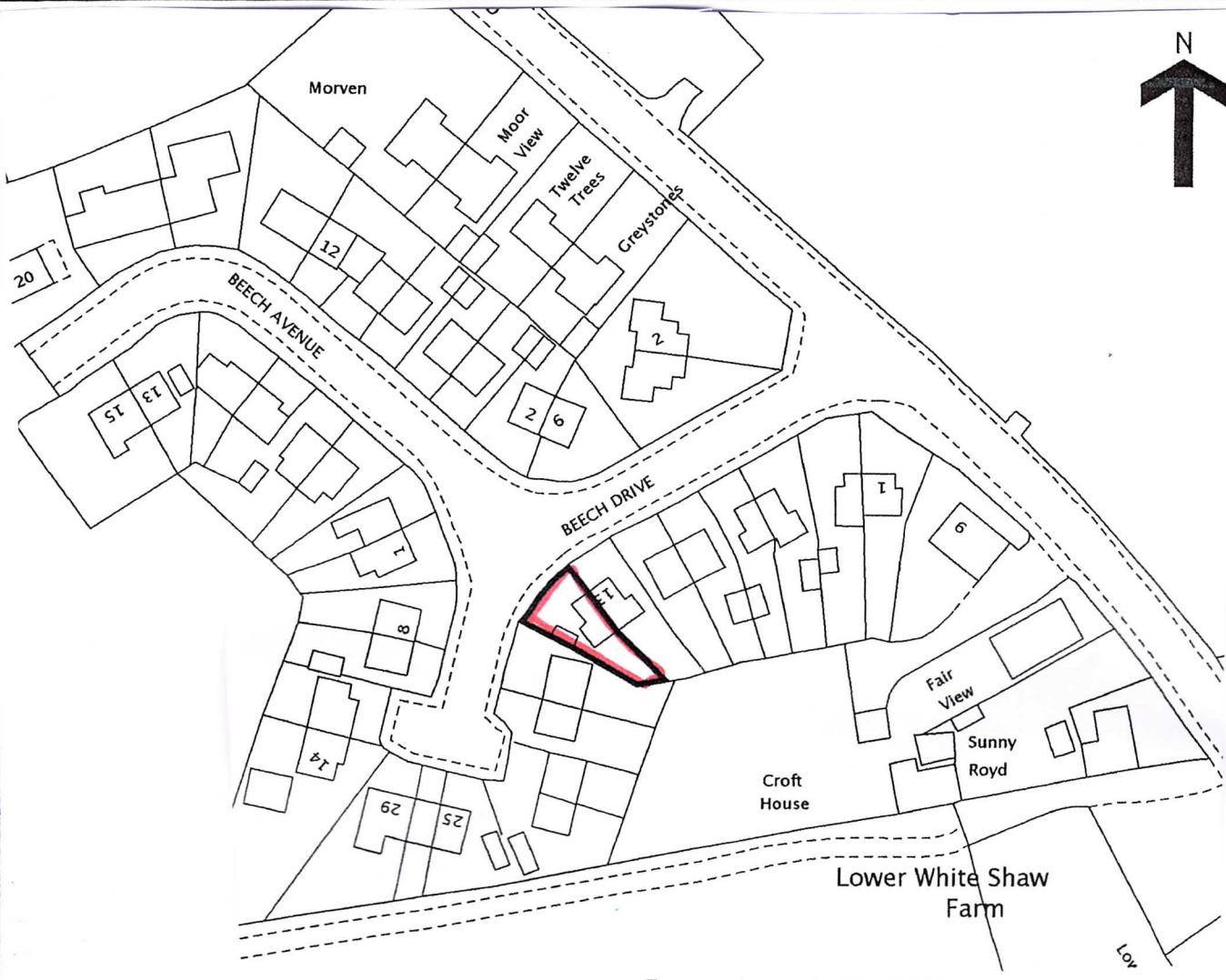
SITE LAYOUT PLAN – SCALE 1-1250 - BD13 4LU