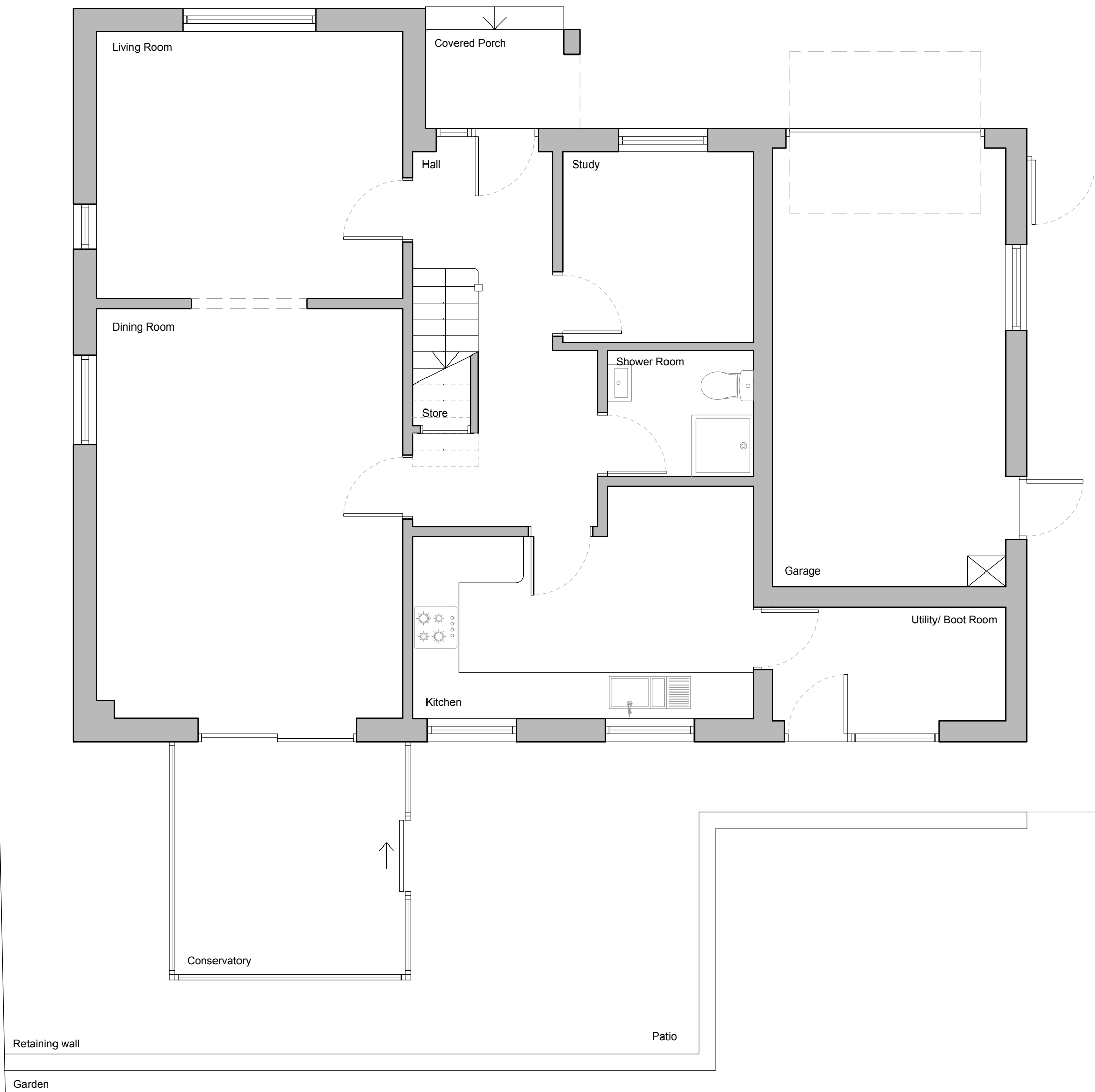
Existing Ground Floor Plan Scale 1:50