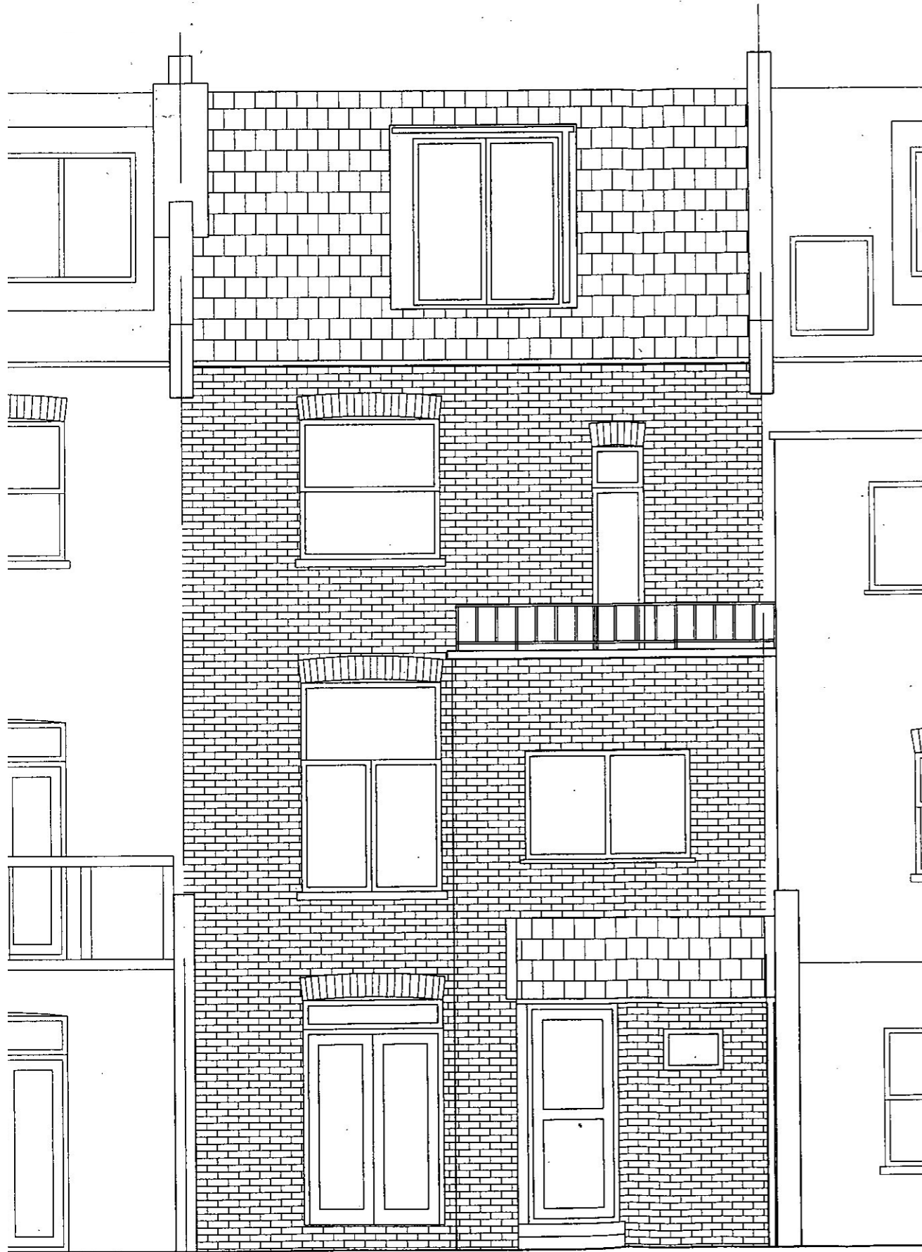
Existing Rear Elevation 1:50 @ A3