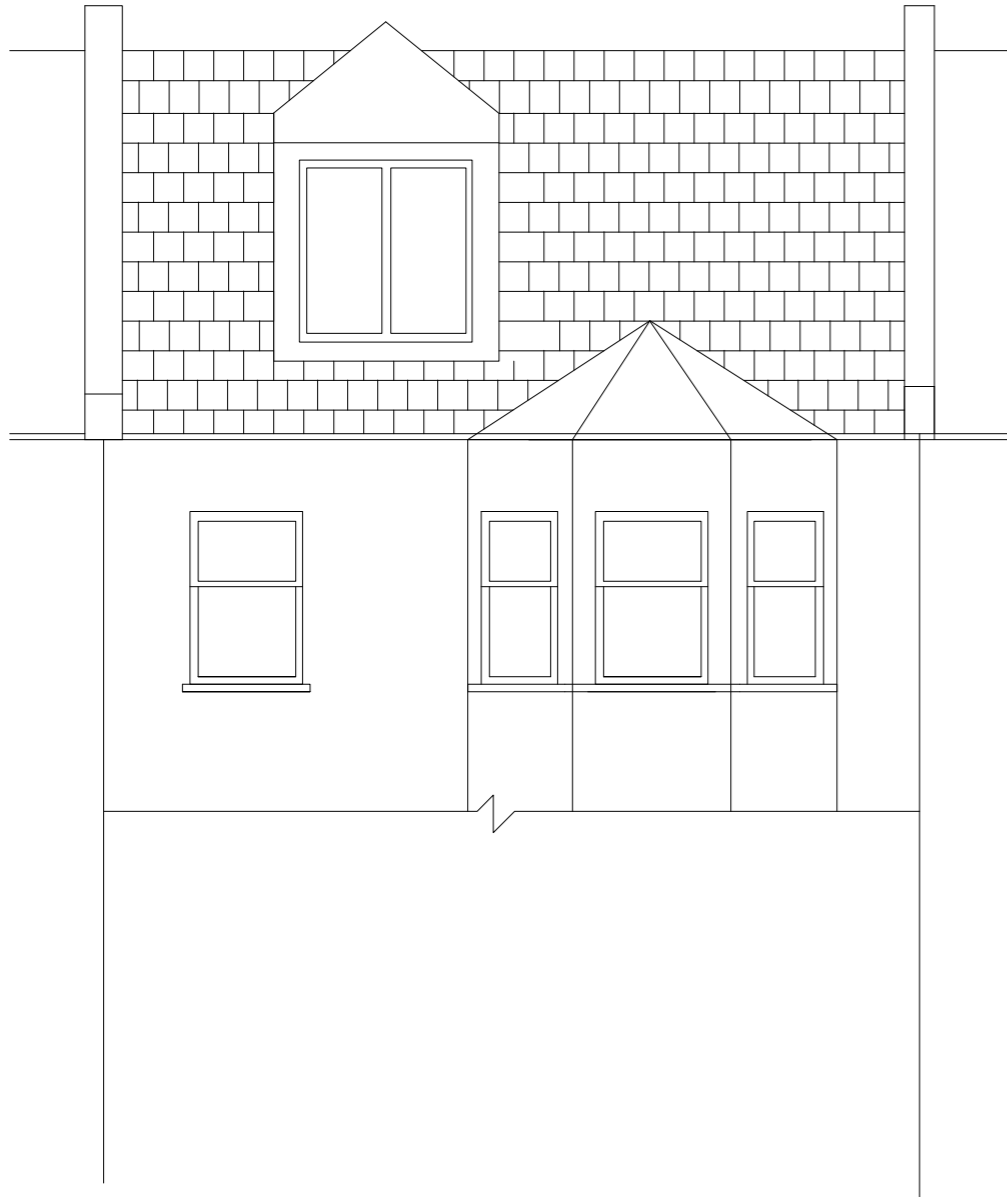
Existing Front Facade 1:50 @ A3