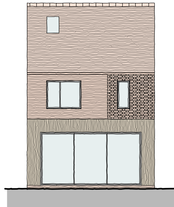
Rear E Elevation 1:100