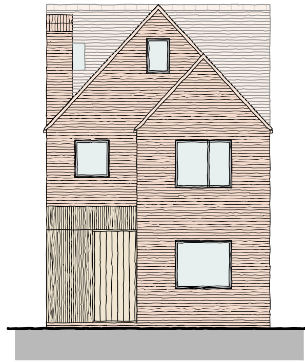
Front w Elevation 1:100

© This drawing is copyright and should not be reproduced in whole or in part without the written permission of Edward Parsley Associates