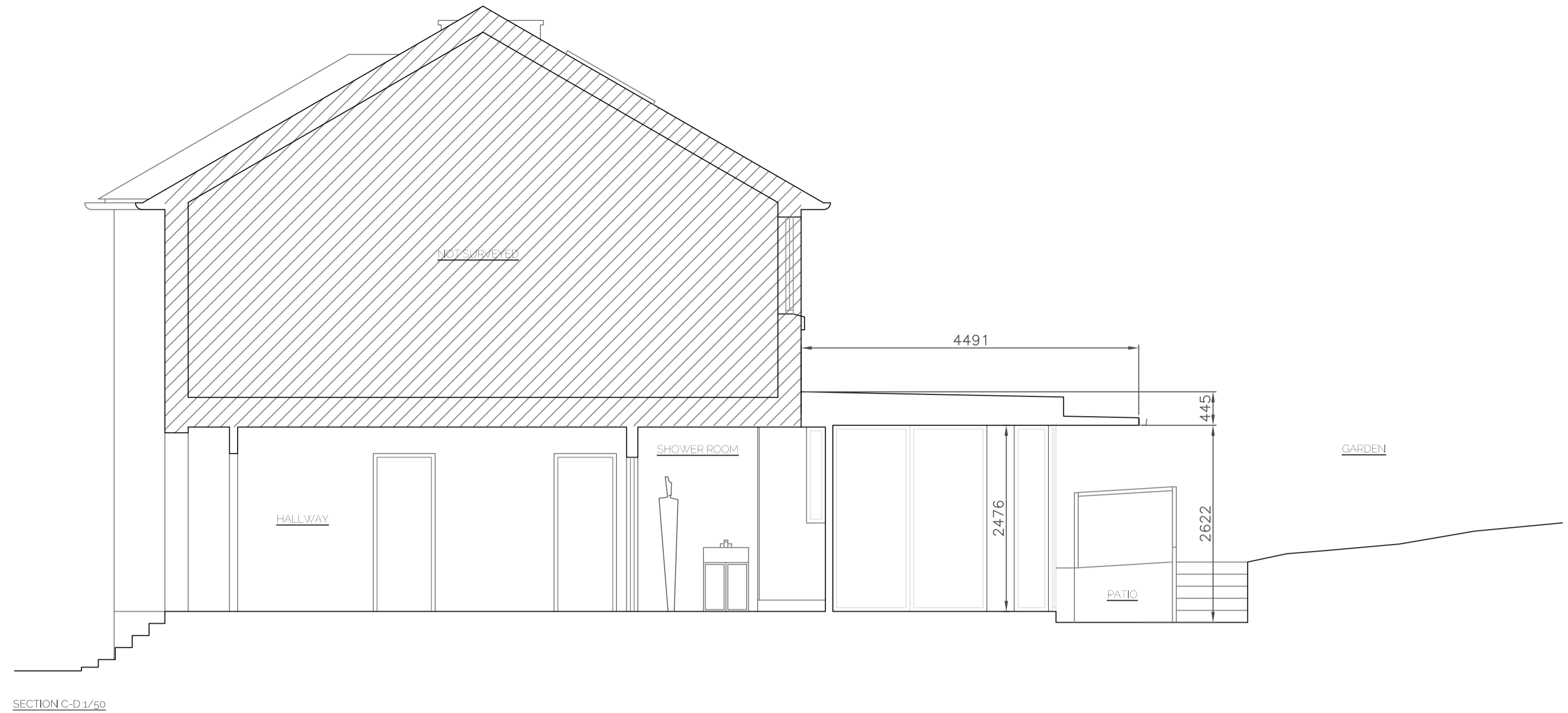
SECTION C-D 1/50