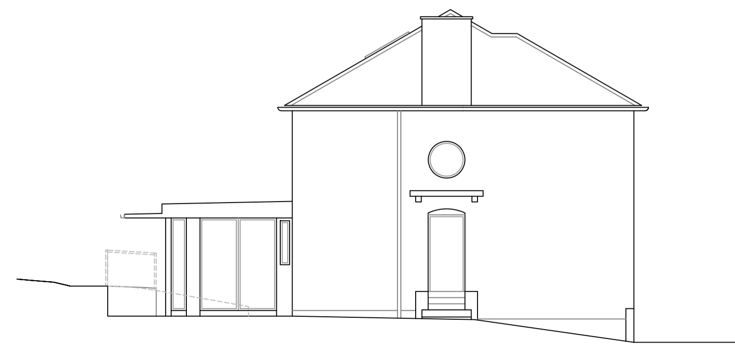
WEST ELEVATION 1/100