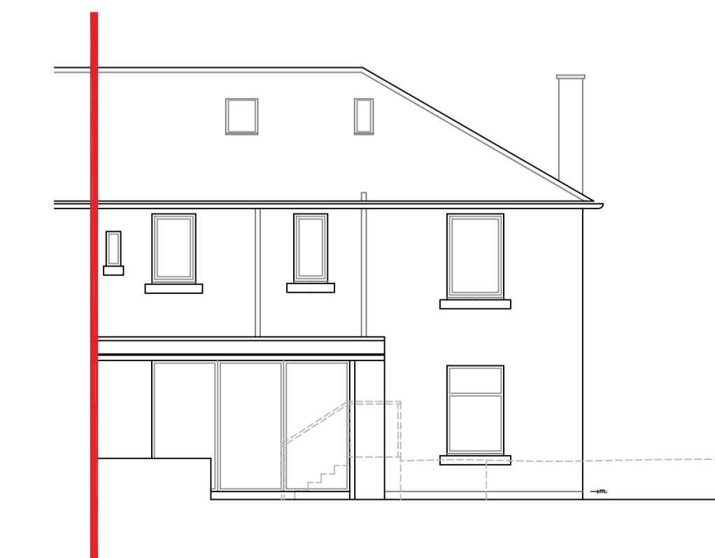
NORTH ELEVATION 1/100