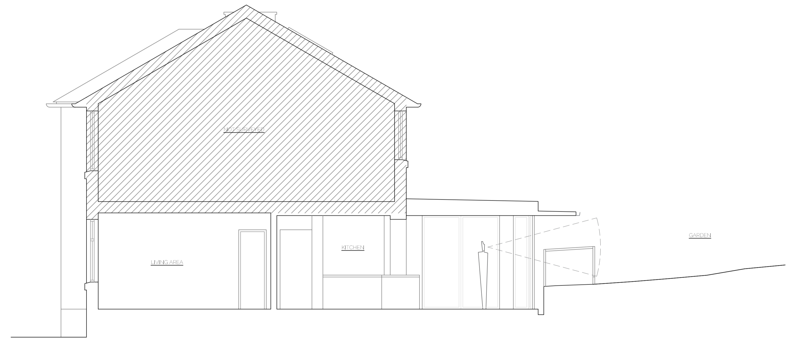
SECTION A-B 1/50