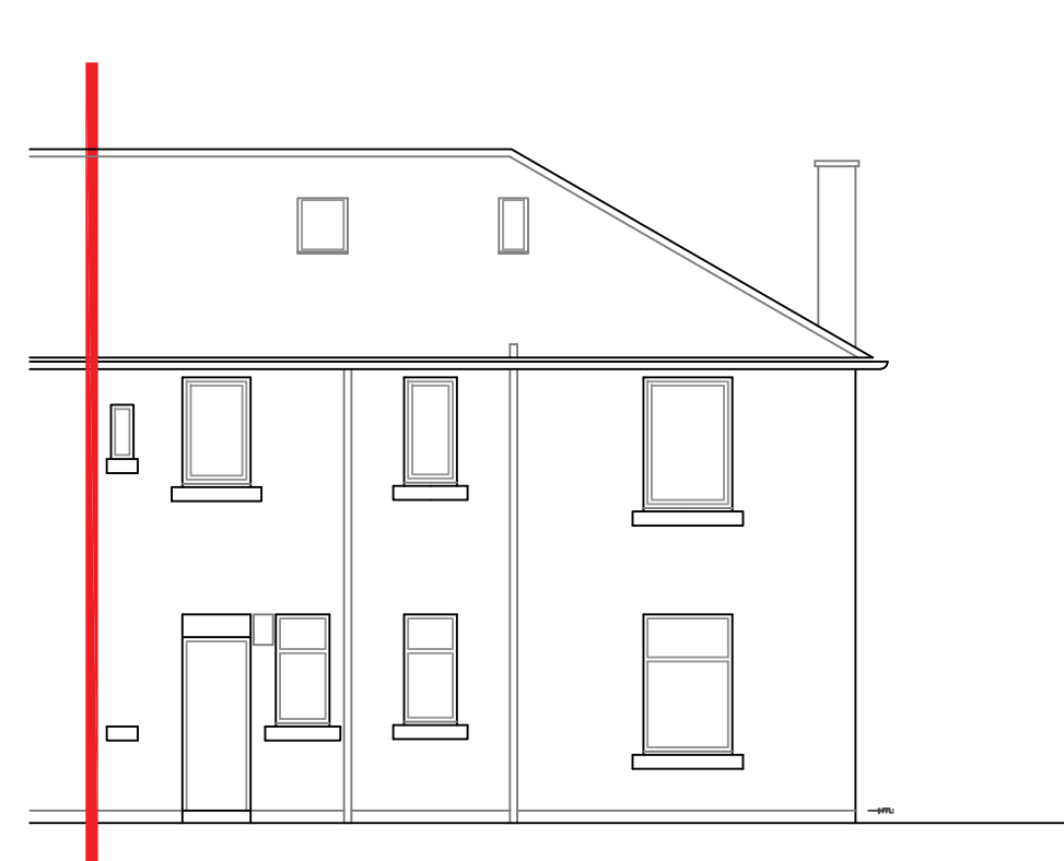
NORTH ELEVATION 1/100