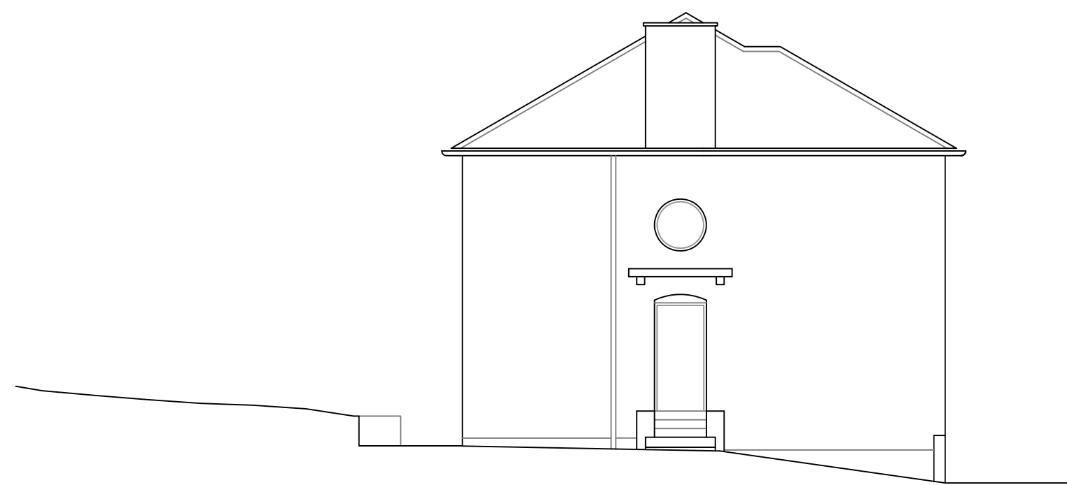
WEST ELEVATION 1/100