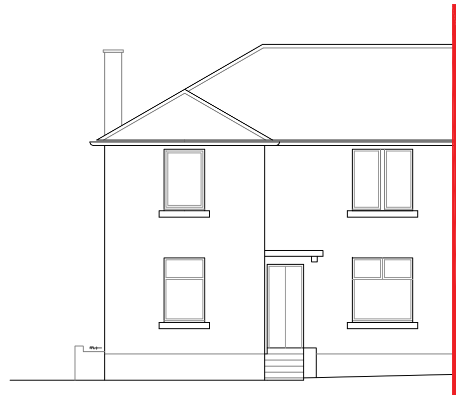
SOUTH ELEVATION 1/100