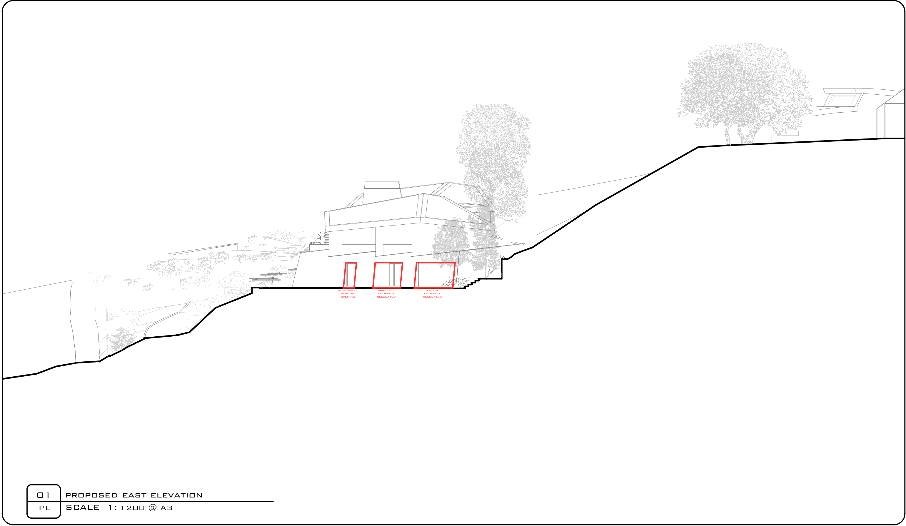
01 PROPOSED EAST ELEVATION PL SCALE 1:1200 @ A3