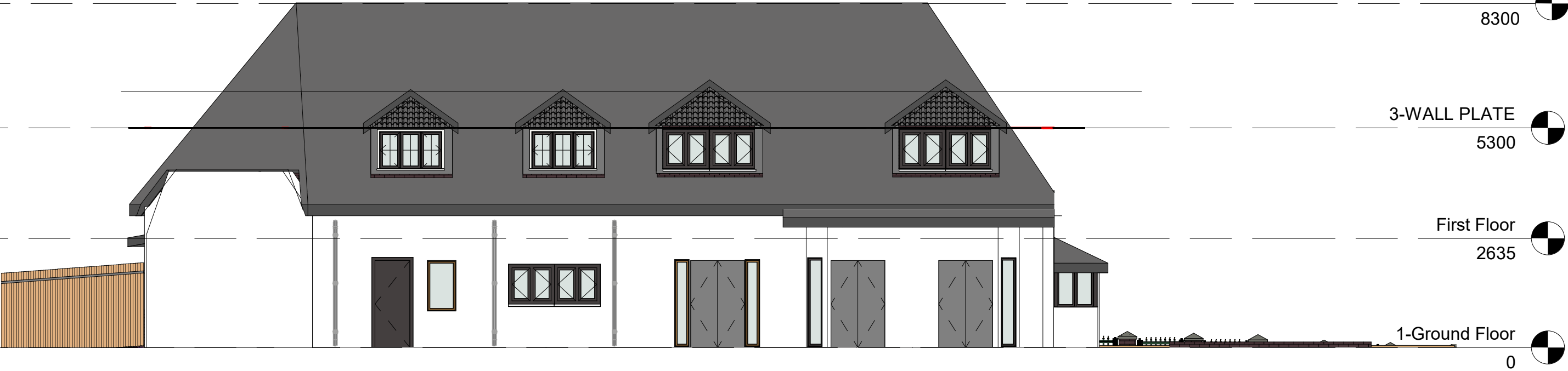
1 North Elevation 1 : 100

These drawings are for use in the planning process only. All measurements should be checked on site. These plans should not be used for structural calculations or any other engineering purpose.