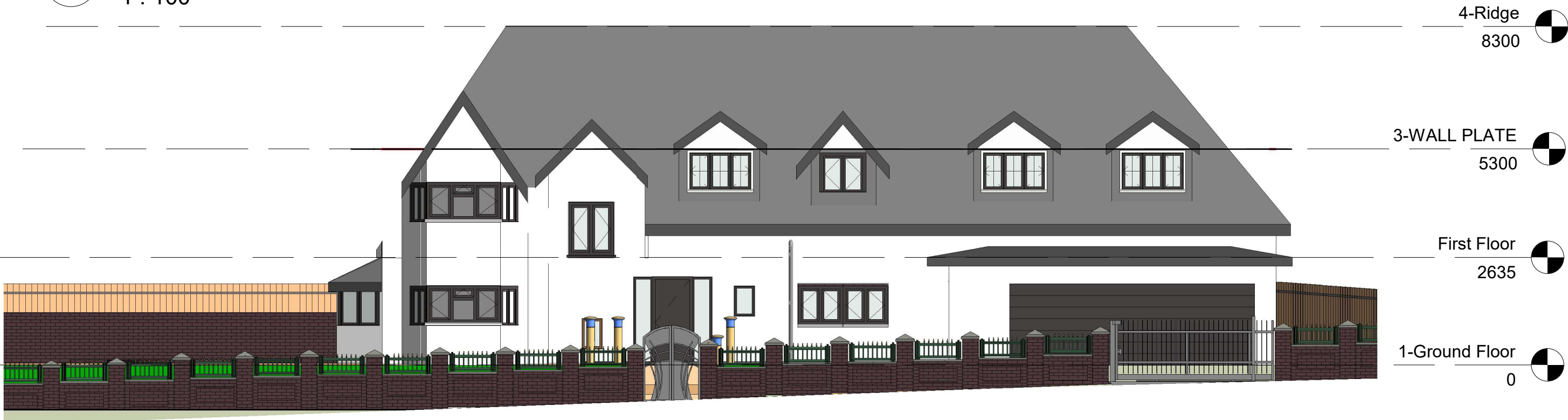
2 South Elevation 1 : 100