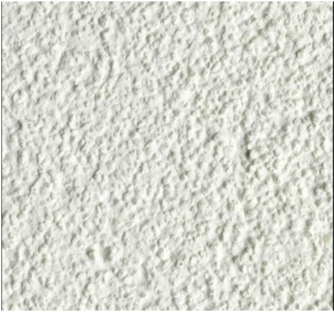
4: All new walls to match existing white silicon render.