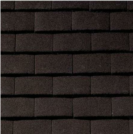
1: Concrete roof tiles to match existing