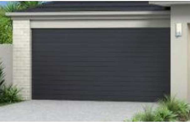
2: The existing garage door to be dismantled and to be set into new location.