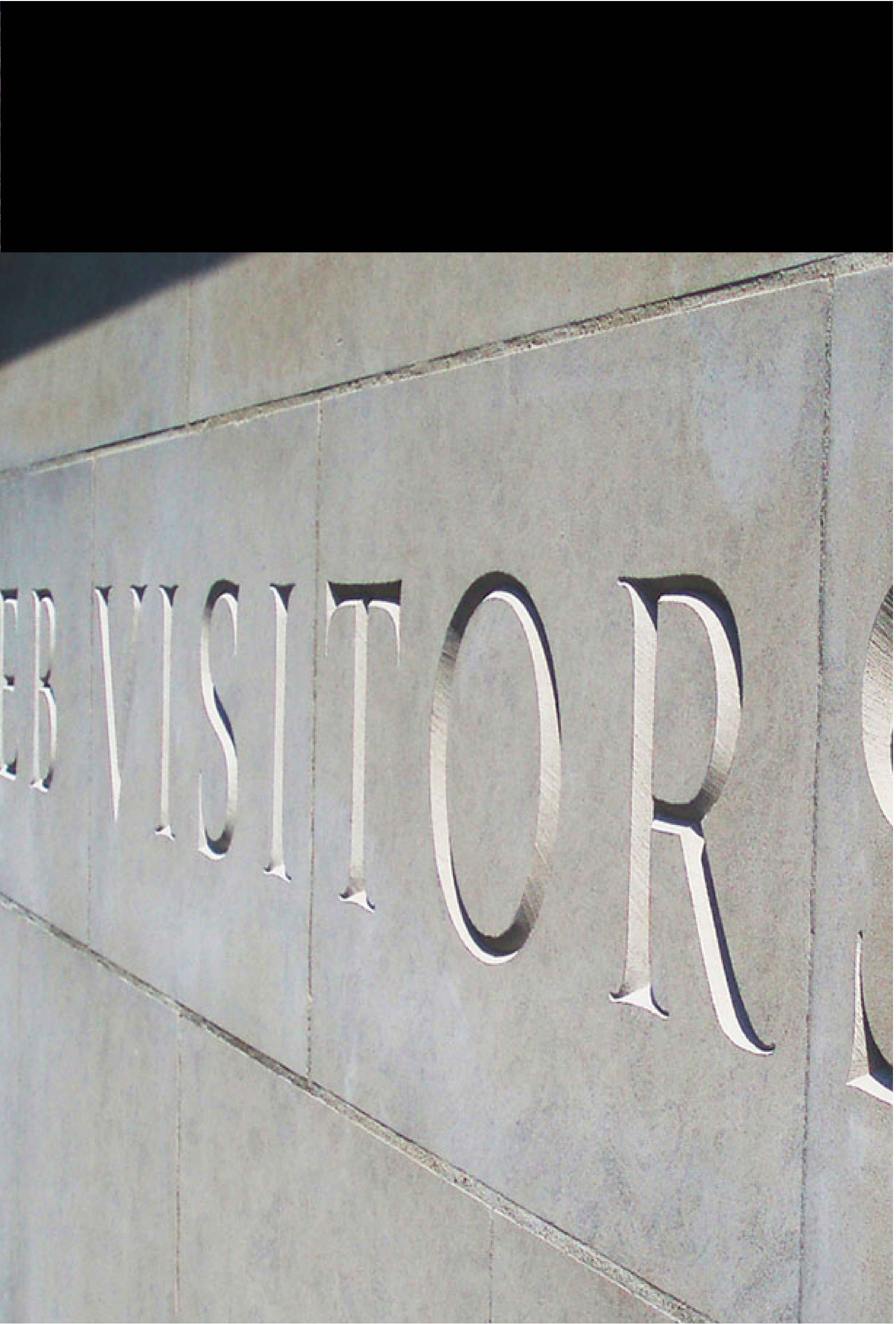
② STYLE OF STONE ENGRAVING