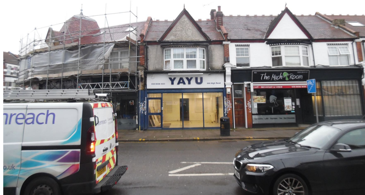
PH1 - Front view from High Road