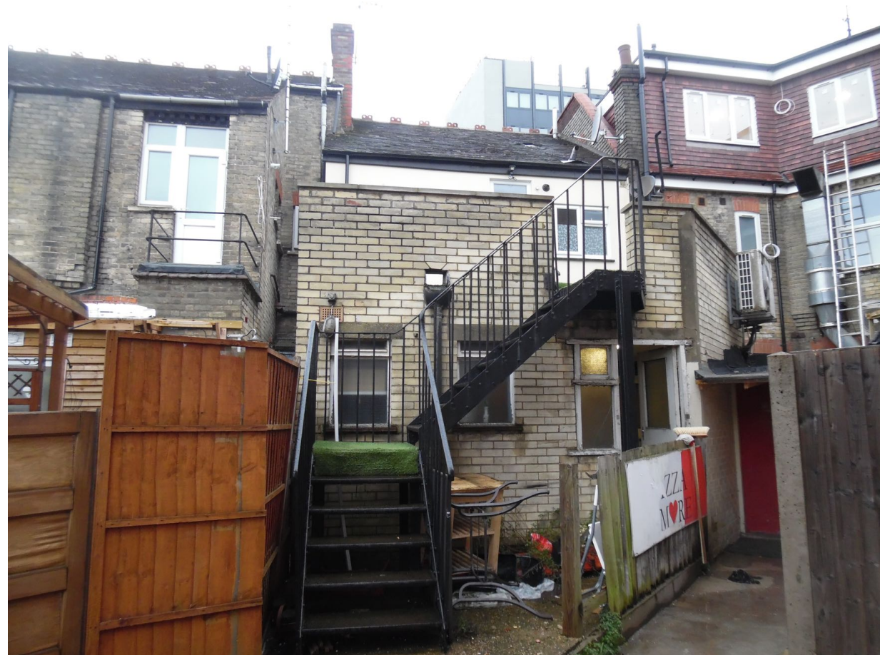
PH2 - Rear view from Churchfield Way