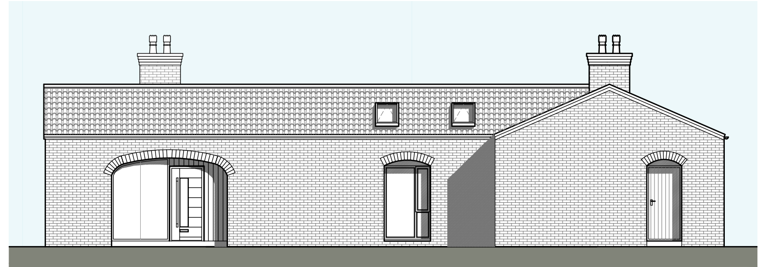
02 PROPOSED SIDE ELEVATION (SOUTH) 1:100