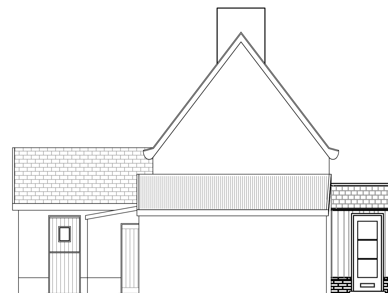
SIDE ELEVATION [SOUTH]